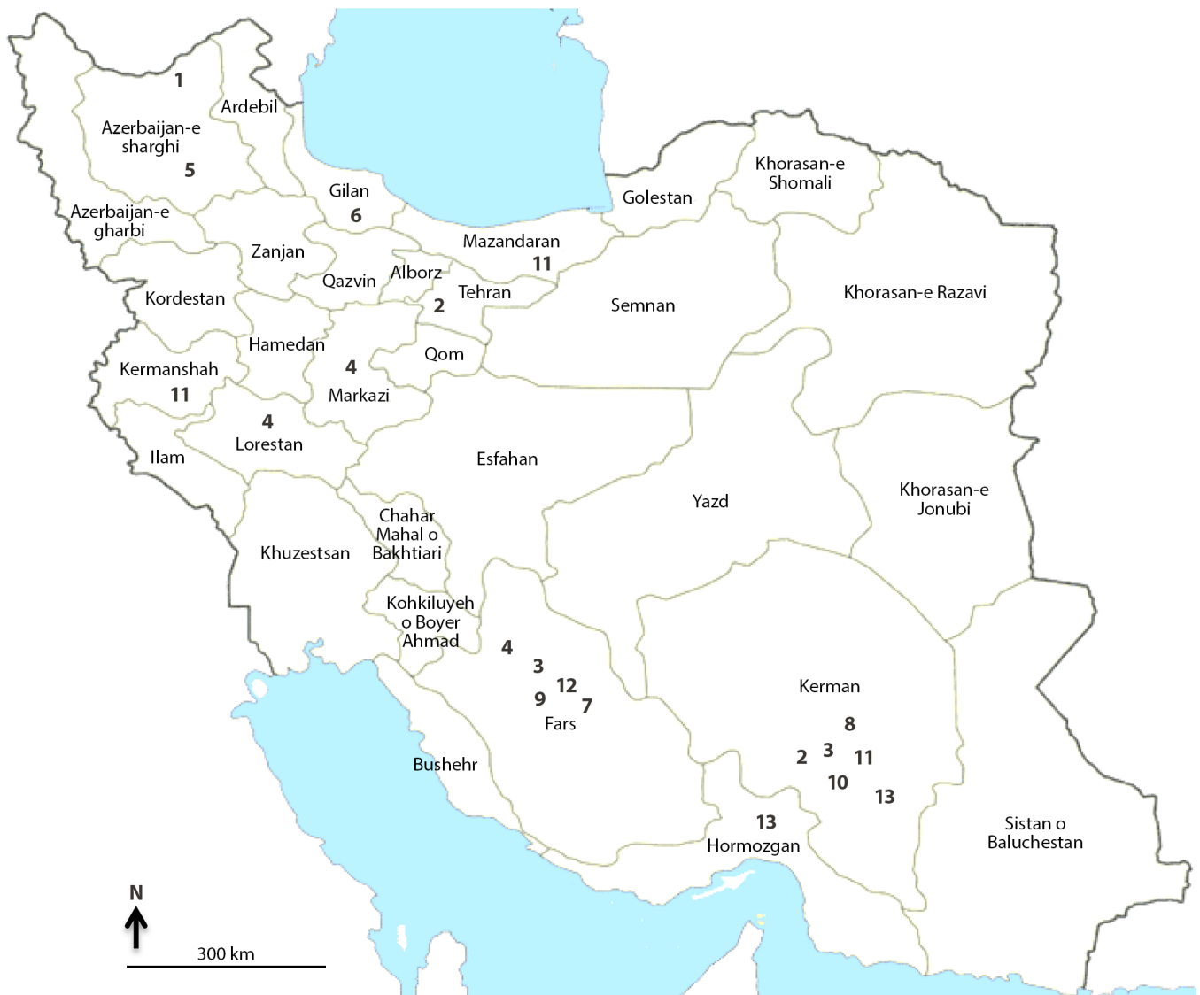
Fig. 1: Distribution of the Cheliferidae Risso, 1827 species reported from Iran (according to Iranian provinces): (1) Beierochelifera peloponnesiacus (Beier, 1929); (2) Dactylochelifera brachialis Beier, 1952; (3) Dactylochelifera gracilis Beier, 1951; (4) Dactylochelifera intermedius Redikorzev, 1949; (5) Dactylochelifera kussariensis (Daday, 1889); (6) Dactylochelifera latreillii (Leach, 1817); (7) Dactylochelifera mrciaki Krumpál, 1984; (8) Dactylochelifera spasskyi Redikorzev, 1949; (9) Ellingsenius fulleri (Hewitt & Godfrey, 1929); (10) Gobichelifera chelanops (Redikorzev, 1922); (11) Hysterochelifera afghanicus Beier, 1966; (12) Rhacochelifera melanopygus (Redikorzev, 1949); (13) Strobilochelifera spinipalpis (Redikorzev, 1918) (Beier 1951, 1971, Mahnert 1974, Schawaller 1983, Judson 1990, Nassirkhani & Takaloo zade 2012, 2013a, 2013b, Nassirkhani & Shoushtari 2014, 2015, Nassirkhani et al. 2016, present study)