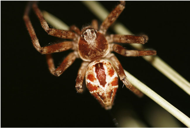
Fig. 3: Philodromus splendens spec. nov. female, live specimen