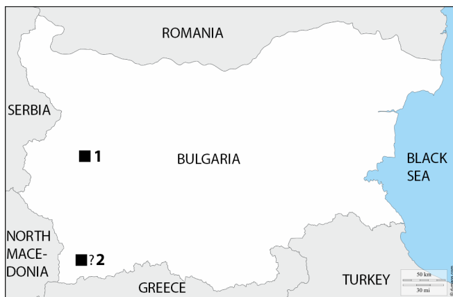
Fig. 4: Known and suspected (question mark) distribution of Philodromus splendens spec. nov. 1. Sofia; 2. Sandanski

Other possible homologies include the philodromid tegular apophysis in Rhysodromus Schick, 1965 (Schick 1965, Szita & Logunov 2008) or even the sclerite called the conductor in the Philodromus infuscatus group although the latter seems to originate from the tegular margin (Dondale & Redner 1969). Identifying homologies in Philodromidae is, however, problematic according to Muster (2009) so until a proper phylogenetic analysis is conducted some of these statements will contain a degree of uncertainty. However, this is beyond the current capabilities of the author and represents a future goal. For that reason, Philodromus splendens spec. nov. is retained in the type genus Philodromus until further revisions, with the latter being possibly in need for revision or even further splitting, according to some authors (this has been addressed in Lecigne et al. 2019).