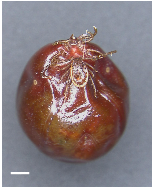
Fig. 4. Copulating pair of Ixodes granulatus . Six cases of on-host copulation of I. granulatus were confirmed. The scale bar indicates 1 mm.

Island. Prior to this study, the only tick species found on Mikura-shima Island was I. philipi (Supplementary Table S1) (Mitani et al. 2007; Takahashi et al. 2005), which mainly infests avian hosts (Guglielmone et al. 2014). Both studies of I. philipi on Mikura-shima Island collected the ticks from the nest burrows of the streaked shearwater. Meanwhile, I. granulatus is often collected from rodent hosts as well as domestic cats and small Indian mongooses ( Urva auropunctata ) on the Nansei Islands, Japan (Kitaoka and Suzuki 1974; Takada 1990; Fujita et al. 1996; Shimada et al. 2003; Fujita et al. 2008; Ishibashi et al. 2009). Thus, the lack of studies on tick infestation in mammalian hosts may explain why I. granulatus was not previously reported here.