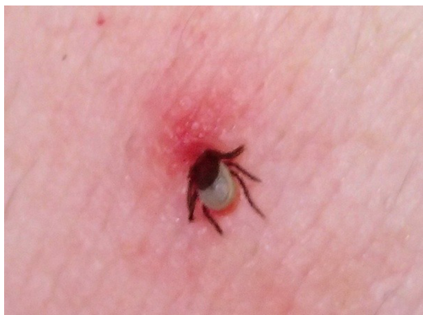
Fig. 2. Human infestation case of Ixodes granulatus (photo taken by Kazunobu Kogi).

** Numbers and percentages of copulating female individuals were also recorded.