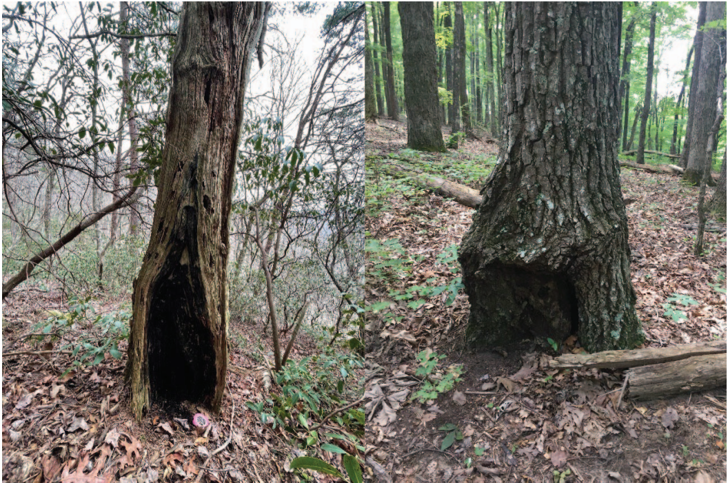
Fig. 1. Left: A dead remnant shortleaf pine tree with multiple fire scars and charcoal at its base persists at the edge of the Cumberland Plateau escarpment at Bridgestone Nature Reserve (BNR) at Chestnut Mountain, Tennessee. Right: Mature and dominant oak with a partially healed over injury at its base likely caused by past repeated and frequent fires.

in human occupation and culture associated with Euro-American settlement (EAS). While acknowledging that Euro-American settlers were present and impacting indigenous populations from an earlier time, we selected the year 1834 as the approximate beginning of the EAS period based on the Indian Removal Act of 1830. This also allowed for direct comparisons with previously published fire history data in the Cumberland Plateau and Eastern Highland Rim ecoregions (Stambaugh et al. 2020). The EAS period included only fire events that occurred prior to the beginning of effective fire suppression activities circa 1935.