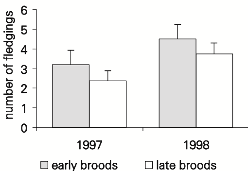
Fig. 3. Relationship between the timing of nesting and mean number of fledging (early broods 1997: n = 13 , 1998: n = 8 ; late broods 1997: n = 8 , 1998: n = 8 ).

In calculating the results of only those nests experiencing breeding success, a significant difference was found in the average number of young leaving the nest in 1997 and 1998 (Mann-