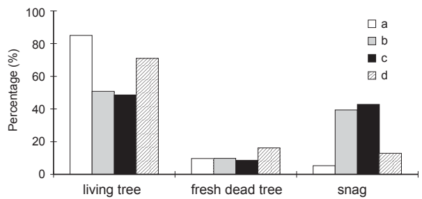
Fig 3. Tree condition of trees systematically sampled in plots (a, N = 863), trees with holes (b, N = 157), nest trees of excavators (c, N = 35) and nest trees of non-excavators (d, N = 62).

vators ( \chi^2 = 11.2 , df = 2 , p < 0.01 ). Given their relative abundance (Fig. 3), holes in snags were underused by non-excavators, while holes in living trees were overused by these birds ( \chi^2 = 14.5 , df = 2 , p < 0.001 ).