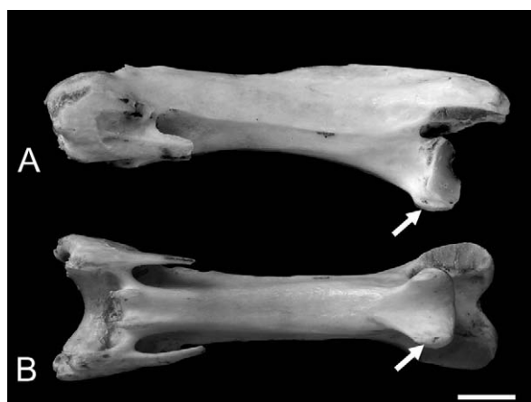
Fig. 2. Fourth cervical vertebra of Greater Flamingo Phoenicopterus ruber in (A) lateral and (B) in ventral view. Arrows indicate the prominent processus. Scale bar = 5 mm.

Another synapomorphy of grebes and flamingos can be found on their cervical vertebrae. Zusi & Storer (1969) pointed out that grebes possess prominent caudolateral projections on the ventral side of their cervical vertebrae ("processus postlaterales") which serve as additional attachment sites for Musculus longus colli ventralis . Landolt & Zweers (1985) designated this structure as processus ventrolateralis which is the only name that is correct both grammatically and anatomically (A. Elżanowski, pers. comm.). Such prominent processes and attachment sites are also known for flamingos (Baumel & Witmer 1993:87, Annot. 121), and prominent processus ventrolaterales are present in † Palaelodus ambiguus (Fig. 2). Taxa traditionally considered as close relatives of either grebes or flamingos, e.g. loons (Gaviidae), finfoots (Heliornithidae), storks (Ciconiidae), lack prominent processus ventrolaterales (Zusi & Storer 1969 and pers. obs.). However, similar processes are present in some other taxa. Baumel & Witmer (1993) mention them for Morus , which I can confirm for the Northern Gannet Morus bassanus (pers. obs.), and I also found such processes in the Red-footed Boobie Sula sula , the Sunbittern Eurypyga helias , and the Kagu Rhynochetos jubatus . Again, other characters suggest a relationship of these taxa to other groups of birds lacking such processes (see Mayr & Clarke 2003).