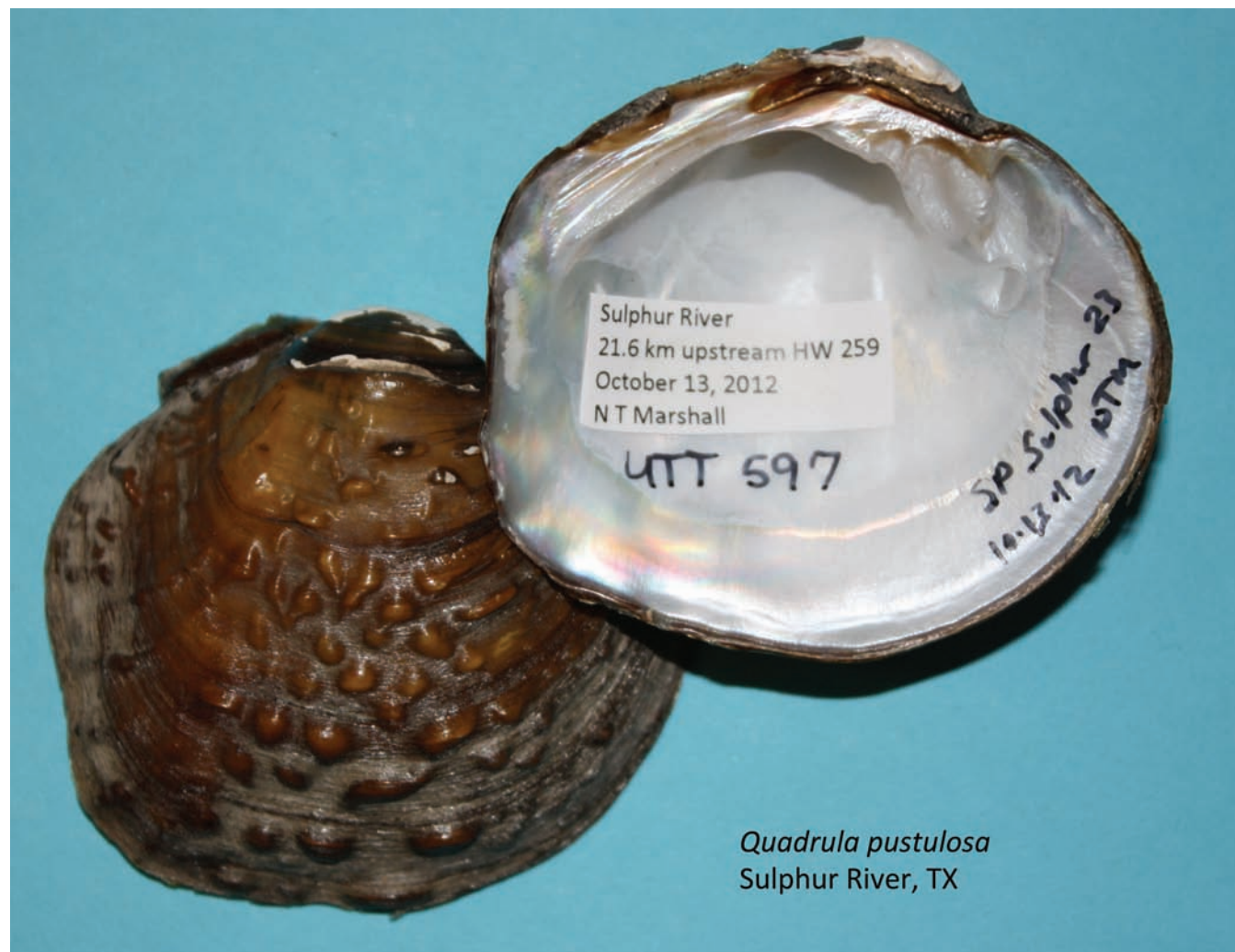
FIGURE 4 Pimpleback ( Quadrula pustulosa ) from the Sulphur River.

lienosa were found in several sites in the Neches River, one site on the Angelina River, often with two or three at a site although only 10 total live individuals were collected.