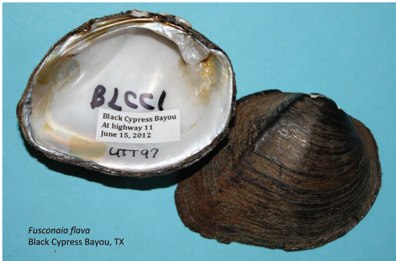
FIGURE 3 Wabash Pigtoe ( Fusconaia flava ) from the Black Cypress Creek.

soniana was very rare and only found in sites close to Texas Highway 84 on the Neches River. This area of the river is connected to the floodplain, which appears to be important for the species (Troia, 2010; Troia & Ford, 2010). Pleurobema riddellii was common in the Neches and Angelina rivers where most of the total 455 live and 33 dead were found. A few individuals of this species were found in the Big and Little Cypress rivers and one live and one dead were found in two sites on the Sabine River. Prior to this study no live P. riddellii had been recorded in the Sabine River in over 35 years. Recently live individuals have also been recorded in the upper Trinity River (J. Krejca, Zara Environmental LLC, pers. comm.). Additional surveys may reveal more localities for this species. Potamilus amphichaenus was one of the rarest overall species with only 13 live and 21 dead recorded in the Sabine and Neches rivers and only one or two individuals at a site. Potamilus amphichaenus was also one of the few mussels in which more dead individuals were found than live ones, which may indicate higher predation rates (Walters & Ford, in press).