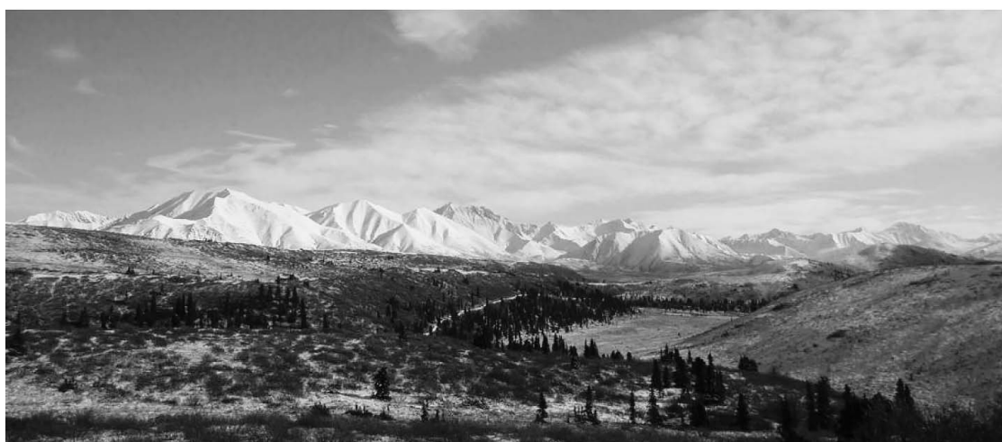
Figure 3. View looking to the northwest (top) and northeast (bottom) from an autumn observation site near Lost Creek on the southern slopes of the Mentasta Mountains, October 2014. In autumn, most Golden Eagles were detected as they migrated along the higher ridges of the Mentasta Mountains to the north of the observation site.

low along slopes or circling low over the landscape) and 91 appeared to be primarily intent on migrating. We did not observe any white feathering on most of the eagles we detected in spring 2014.