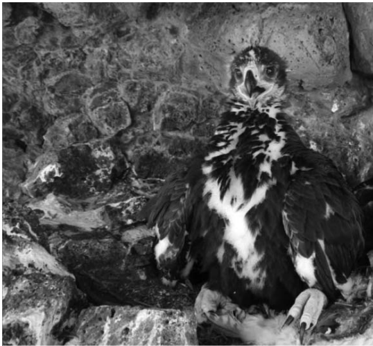
Figure 2. Photograph of a 51-d-old Golden Eagle nestling, first observed within 1 d of hatching. See also Plate 12 in Driscoll (2010) for an image of a 7.5-wk-old eaglet.

Postupalsky (1974) defined a productive or successful nest as one from which at least one young fledged, or if actual fledging was not observed, one in which at least one young was raised to an advanced stage of development (i.e., near fledging age). Ideally, this advanced stage of development should be defined consistently within a species to allow valid comparisons among studies. It would be misleading to compare results from a study that considered nests with downy young to be successful (e.g., Moss et al. 2012) to one that classified nests as successful only if and when young actually fly from the nest on their own volition (e.g., Beecham 1970).