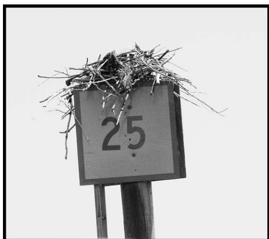
Figure 1. An Osprey nest built on an aid to navigation (e.g., channel marker) that poses a conflict.