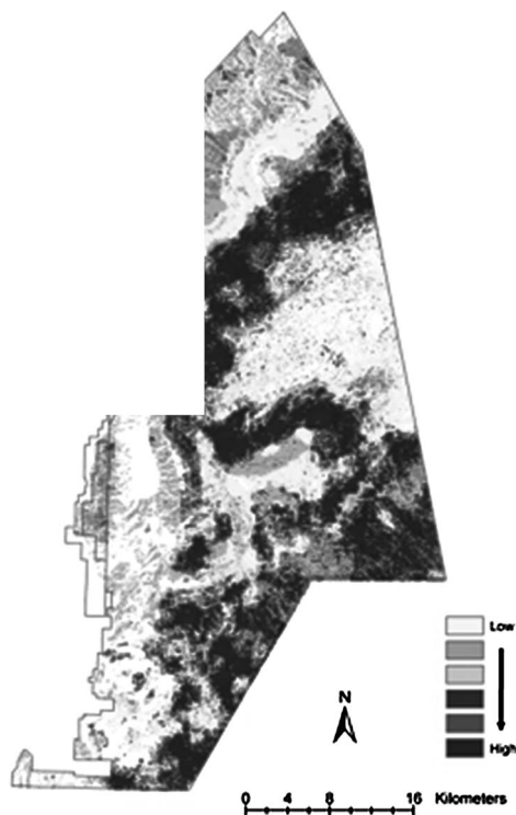
Figure 1. Habitat suitability model for Aplomado Falcons on the Armendaris Ranch. Map subset from model detailed in report (Young et al. 2002).

The Peregrine Fund employed standard raptor hacking (reintroduction) procedures for releasing 102 captive-bred Aplomado Falcons at the Armendaris Ranch from 2006 through 2011 in June, July, and August (Hunt et al. 2013). This procedure involved holding juvenile aplomados, with color VID (visual identification) and aluminum U.S.G.S. bands, in a hack box, for 7–10 d, on an elevated platform erected in suitable habitat, and then releasing them at an age when they would naturally fledge (Mutch et al. 2001). On release day, the box was opened remotely allowing the birds to emerge