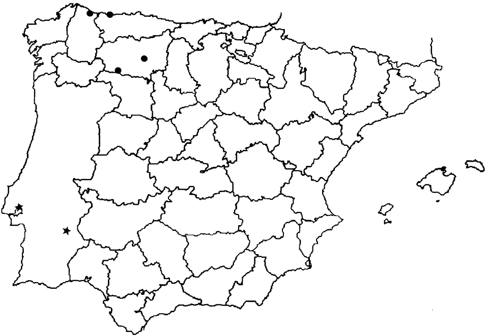
Fig. 2. Distribution of Bromus cabrerensis ● and B. nervosus ★.

800 \mu\text{m} thick, interrupted by a central cavity of 200–1700 \mu\text{m} in diameter. Epidermis with some prickles and macrohairs.