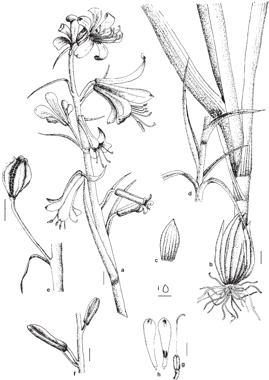
Fig. 1. Notholirion koeiei Rech.f. – a: inflorescence; b: habit; c: coat of the tunica; d: portion of the leafy stem; e: capsule; f: flower buds; g: pistil; h: tepal, dorsal (1) and ventral (2) side; i: seed. – Scale = 1 cm; drawing after plants of the population from near Aqrah.