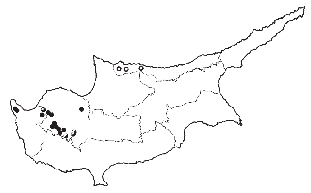
Fig. 2. Distribution of Phlomis cypria according to records by Alziar 2000, Meikle 1985 and in the text. – Circles: subsp. cypria ; dots: subsp. occidentalis ; half dots refer to observations of the latter by Tsintides 1998 and Tsintides & al. 2002. Border lines of the phytogeographical divisions following Meikle (1977, 1985).

≡ Phlomis cypria var. occidentalis Meikle in Ann. Musei Goulandris 6: 93. 1983.