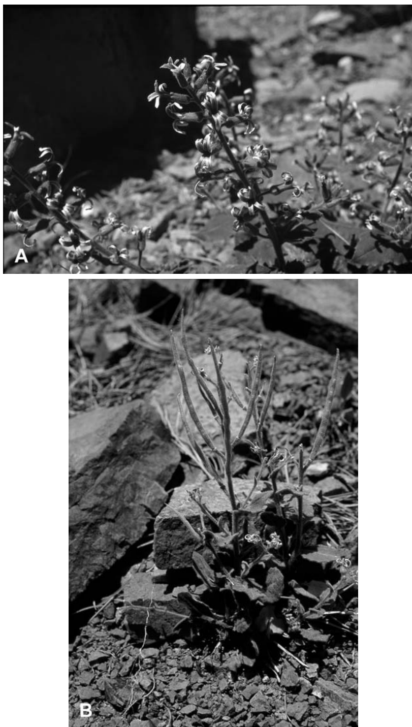
Fig. 2. Hesperis kuerschneri at its type locality SW Turkey, Denizli, Tuzla Beli, 1300 m – A: flowering, 7.5.2002 ; B: fruiting, 25.5.2005. Downloaded From: https://bioone.org/journals/Willdenowia on 04 Dec 2024 Terms of Use: https://bioone.org/terms-of-use