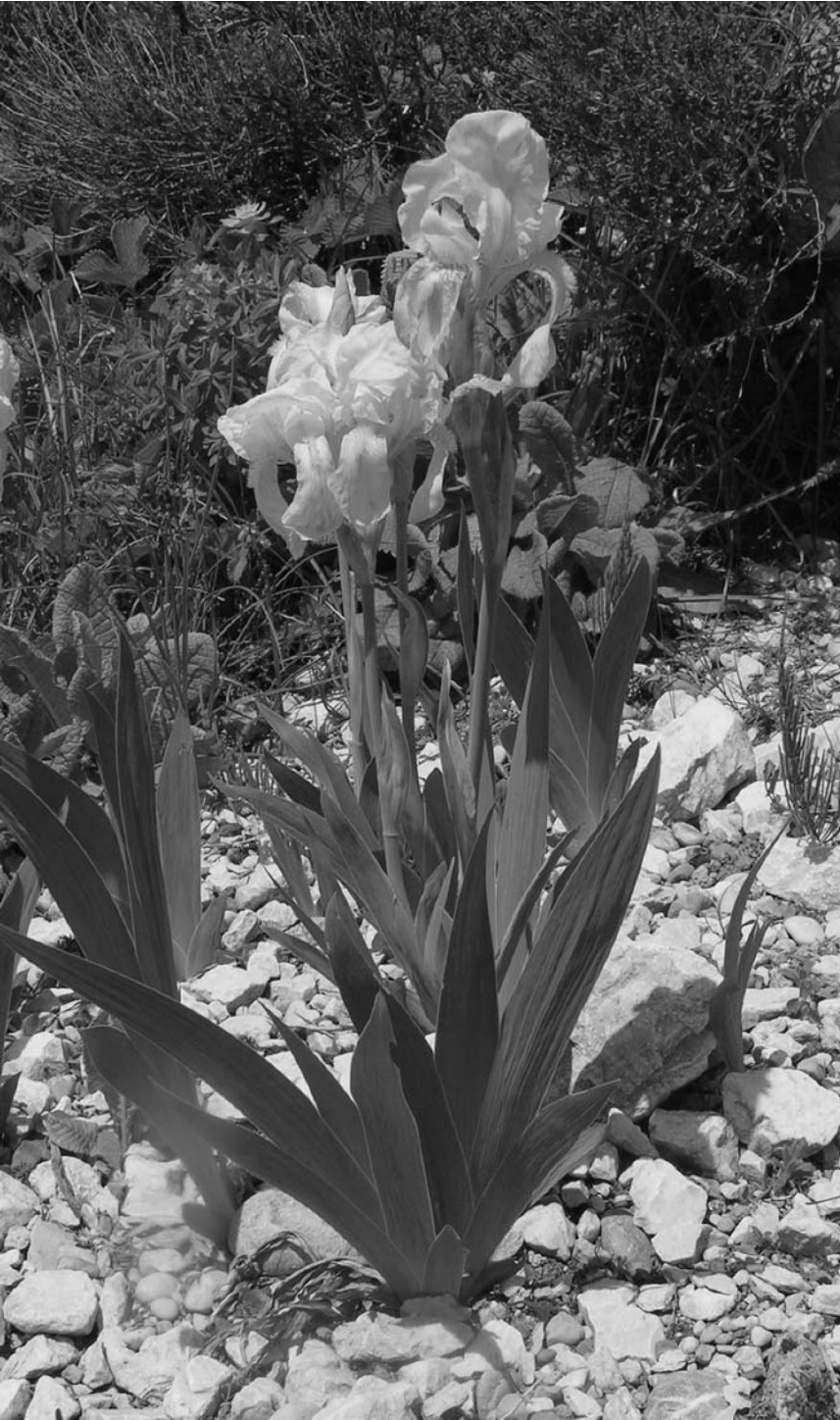
Fig. 2. Iris orjenii – plants from the type collection cultivated at the Botanischer Garten München.