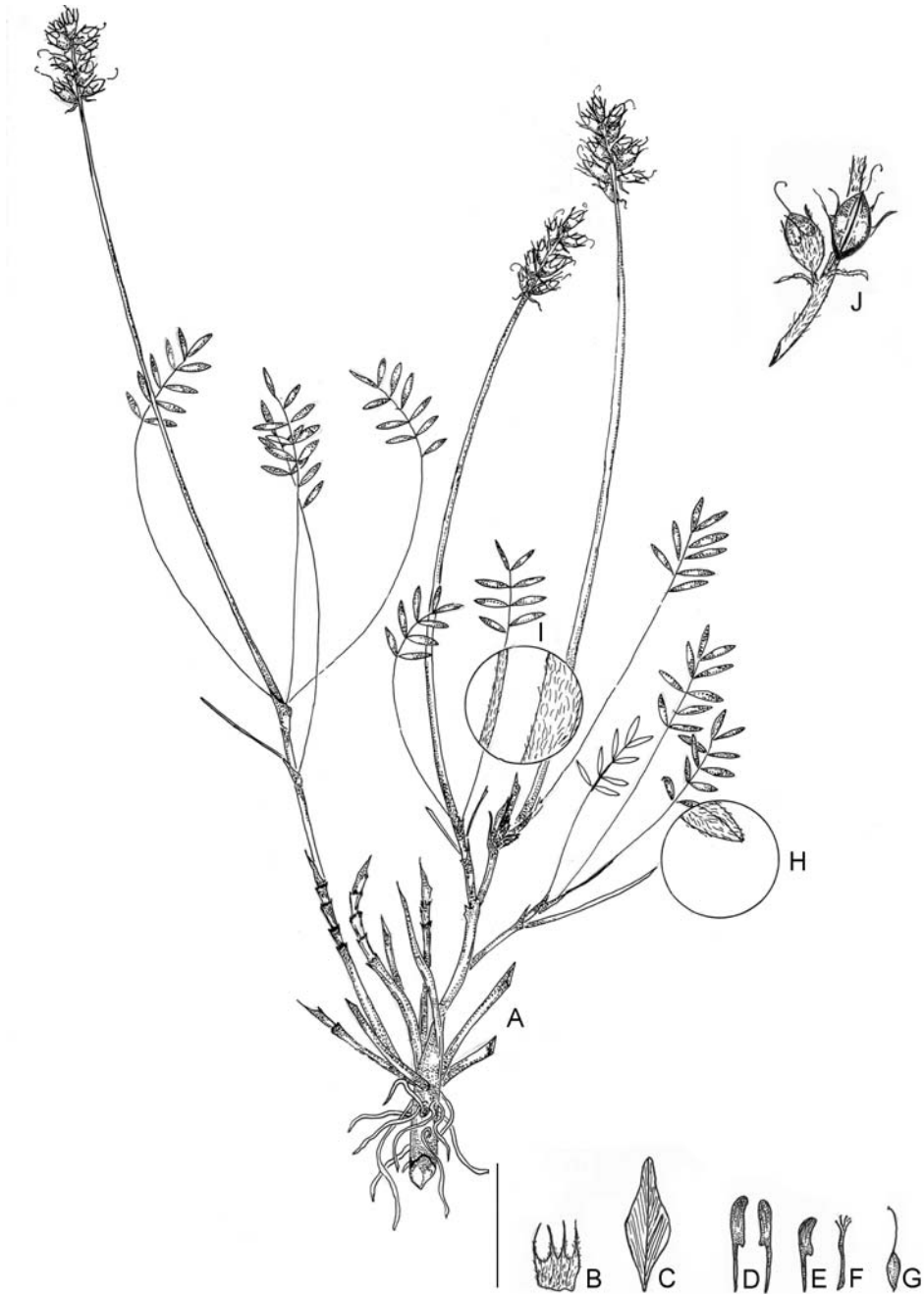
Fig. 2. Astragalus kadschoroides – A: habit (with fruits); B: calyx; C: standard; D: wings; E: keel; F: androecium; G: gynoecium; H: indumentum of leaflet; I: indumentum of rachis and peduncle; J: pod. – Scale bar A = 3 cm, B-G, J = 1.5 cm; drawn after the type collection.