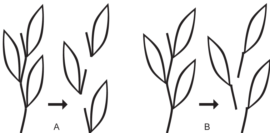
Fig. 1. Aegilops , schematic presentation of two modes of spike disarticulation – A: spike disarticulating in dispersal units of the “barrel type”; B: spike disarticulating in dispersal units of the “wedge type”.

Holotype: Greece, E Aegean Islands, Nomos of Dodekanisos, Eparchia of Rhodes, c. 0.2 km NE Salakos, Wegrand, c. 150 m, 16.5.2004, Ristow & Doyle 601/04 (B). – Fig. 2A-C.