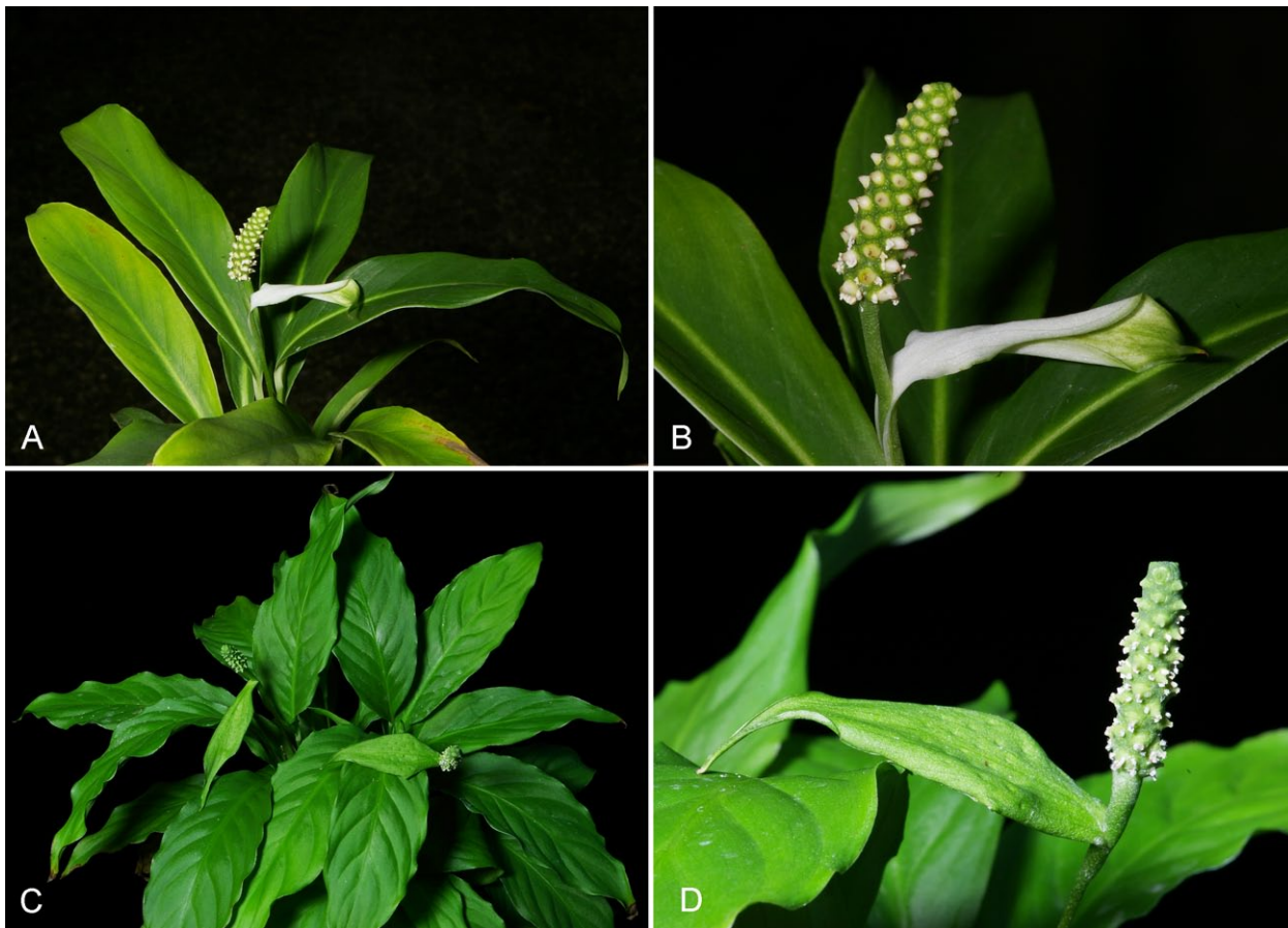
Fig. 1A–B. Spathiphyllum pygmaeum – whole plant (A); inflorescence (B), note the white spathe with a green apex and recurved margins. – C–D: S. minor – whole plant (C); inflorescence (D), note the completely green spathe. – A–B from the plant cultivated in the Botanical Garden Munich of which the holotype was preserved, C–D from Bogner 2978, Botanical Garden Munich. – All photographs by Günter Gerlach.

slightly thinner, third order veins very thin and inconspicuous. Inflorescence shorter than the leaves; peduncle c. 8 cm long and c. 1.8 mm in diam., terete, green, mostly enclosed by the sheath of the preceding leaf and projecting for only c. 1 cm beyond; spathe narrowly elliptic, c. 3 cm long and 0.9 cm wide, pure white on both sides but midvein light green, base decurrent, apex c. 0.8 cm long, green, margin of spathe recurved; stipe of spadix c. 1 cm long and 1.2 mm in diam., green; spadix subcylindric to slightly conoid (narrowing towards apex), c. 2 cm long and to c. 0.5 cm in diam. Flowers bisexual, c. 1.8 mm in diam.; tepals 6, truncate, c. 1.5 mm long, upper part green and 0.8 mm wide, lower part white; gynoeceium c. 2 mm long, ovary obovoid, 1.4–1.5 mm long, in upper part 1.3–1.4 mm in diam., at base c. 0.9 mm in diam., 2-locular; ovules anatropous, 1 ovule in each locule, c. 0.5 mm long; style conoid, white, c. 0.5 mm long, exserted from the tepals, stigma small, disk-like, c. 0.4 mm in diam., whitish when fresh, becoming brownish; tissue of gynoeceium with many trichoslereids; stamens 6, filament flat, 1–1.1 mm long 0.7–0.8 mm wide, shorter than the tepals during the female stage, elongated to about 1.5 mm length at maturity (in the male stage),