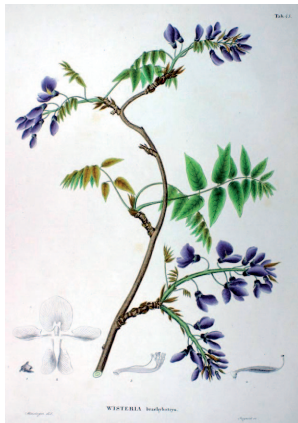
Fig. 2. Wisteria brachybotrys , coloured lithograph by W. Siegrist based on S. Minsinger, the latter based on Kawahara Keiga. – From Siebold & Zuccarini (1839: t. 45), London, British Library.

eral leaf axils per stem during summer. Flowers are pale whitish green, creamy white, pale yellow or rarely purple. This species has been placed in the separate genus Millettia Wight & Arn. by some workers, based on the absence of a pair of thickened callosities or auricles at the base of the standard petal, such auricles being present in other species of Wisteria . This is now considered to be an autapomorphic character for W. japonica . Recent studies (Hu & al. 2002) have shown that the genus Callerya Endl. is in fact the nearest relative to Wisteria based on nuclear DNA sequence data.