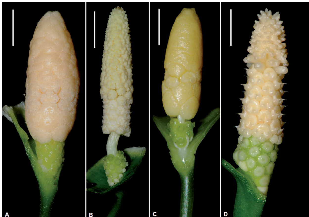
Fig. 3. Spadices (spathe artificially removed) in the Aridarum Burtii Complex – A: A. burttii from P. C. Boyce AR-3726; B: A. kazuyae from K. Nakamoto AR-3927; C: A. minimum from K. Nakamoto AR-3847; D: A. orientale from K. Nakamoto AR-3912. – Scale bar = 1 cm; photographs by P. C. Boyce.