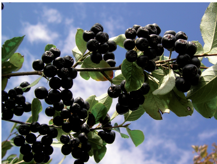
Fig. 2. Sorbaronia mitschurinii , fruiting branch. – Cultivation, 11 Sep 2004.

hybridogenous genus is Sorbocotoneaster Pojark. The natural hybrid between Sorbus aucuparia L. and Cotoneaster laxiflorus Lindl. (syn. C. melanocarpus (Bunge) Loudon), Sorbocotoneaster pozdnjakovii Pojark., was studied morphologically (Pojarkova 1953) and cytologically (Krügel 1992). Three distinct, yet sympatric, morphotypes were discovered: the primary hybrid (triploid) closely approaching S. aucuparia , the putative backcross with S. aucuparia (tetraploid) intermediate between the parents, and the putative backcross with C. laxiflorus (pentaploid) closely approaching C. laxiflorus . If it were not for the apomictic reproduction, A. mitschurinii would have been taxonomically included in S. fallax ; as far as its taxonomic separation is maintained, its transfer to Sorbaronia is justified and is consequently effected here.