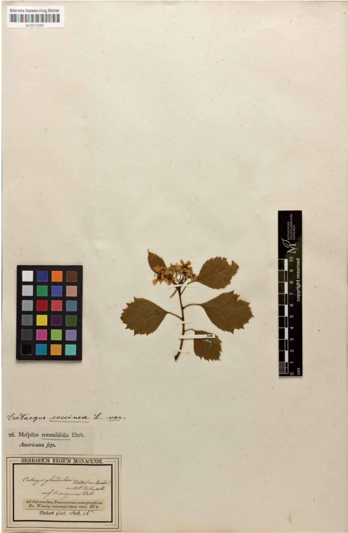
Fig. 3. Neotype of Mespilus rotundifolia – Ehrhart (1792), Plantae selectae hortuli proprii 3: No. 26 (M 0213350).