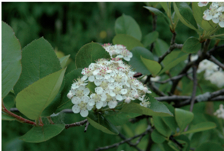
Fig. 1. Sorbaronia mitschurinii , flowering branch. – Cultivation, 29 May 2011.

In spite of the intergeneric origin, Leonard (2011) decided to maintain Aronia mitschurinii in Aronia because of its greater similarity to the species of the latter. However, an analogous case when variable intergeneric hybrids with Sorbus as one of the parents are accommodated in a single