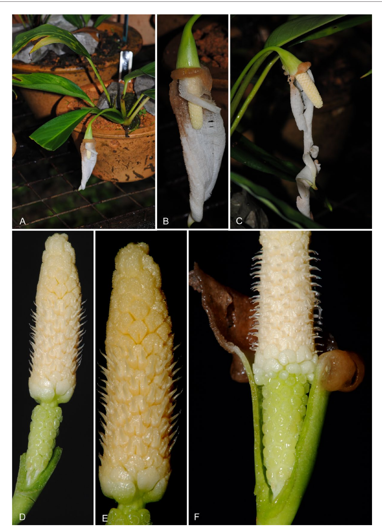
Fig. 3. Aridarum uncum – A: cultivated plant with inflorescence at staminate anthesis; note the pendent inflorescence, and the disintegrating spathe limb; B & C: inflorescence at staminate anthesis; D: spadix (spathe artificially removed) at end of pistillate anthesis; note that the interpistillar staminodes have yet to expand, and that the thecae horns are directed upwards; E: detail of appendix, staminate zone, and interstice staminodes; F: inflorescence at late staminate anthesis, with the lower spathe artificially removed; note the deliquescing remnants of the spathe limb, that the thecae horns have reflexed, many with a droplet at the tip, and that the interstice staminodes have expanded laterally. – Photographs from K. Nakamoto AR-3901, A–F by P. C. Boyce.