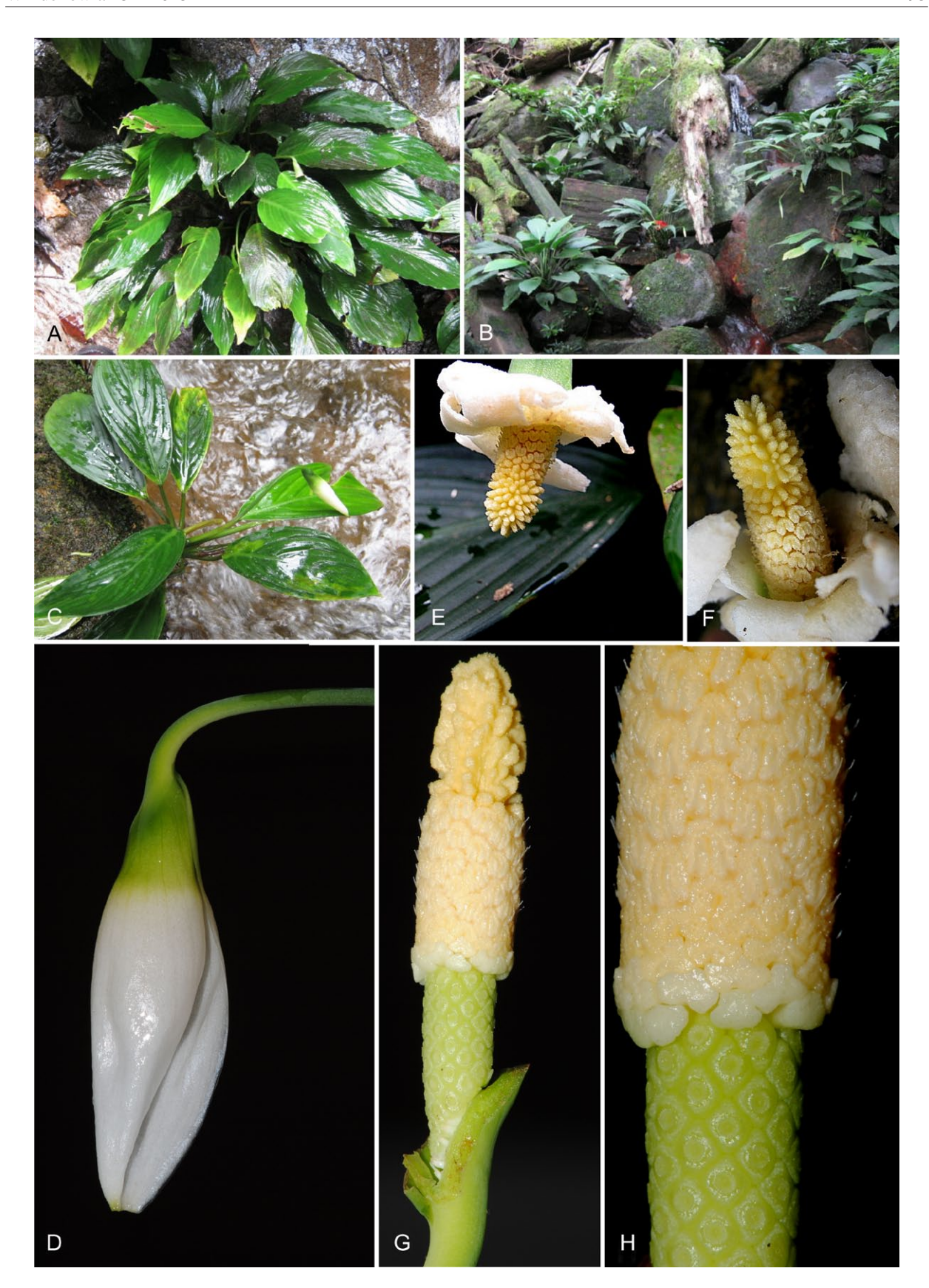
Fig. 2. Aridarum rostratum – A–C: plants in habitat; note the pendent inflorescences visible (B, centre and mid right); D: inflorescence at early pistillate anthesis; E & F: inflorescence at staminate anthesis; note that with the majority of the spathe limb is already shed; G: spadix (spathe artificially removed) at onset of staminate anthesis; H: detail of spadix fertile zones at onset of staminate anthesis; note that the interpistillar staminodes are beginning to expand laterally. – Photograph A from K. Nakamoto AR-3538 ; B–H from K. Nakamoto AR-3532 ; A–F by K. Nakamoto; G and H by P. C. Boyce.