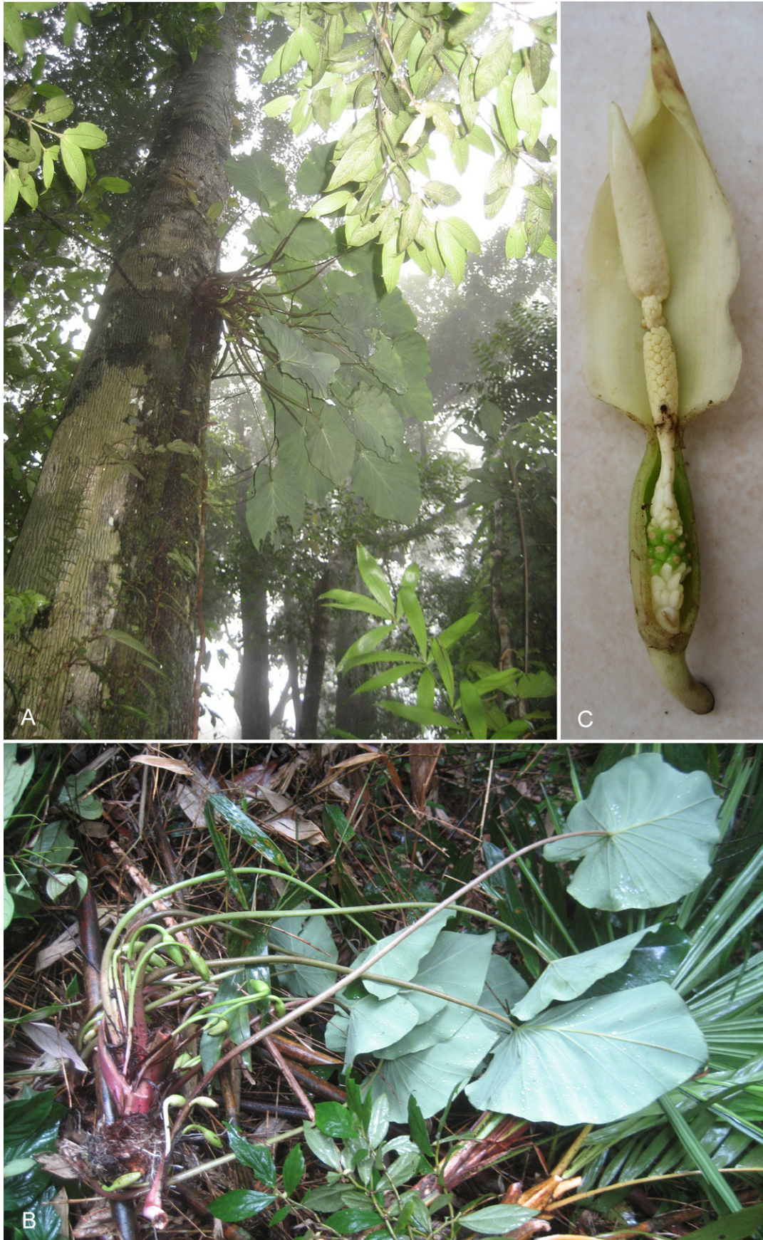
Fig. 4. Alocasia vietnamensis – A: plant in habitat; B: habit; C: inflorescence with spathe tube opened to show spadix. – Photographs: Vietnam, Da Nang province, Ba Na-Nui Chua National Park, 24 Oct 2008, V. D. Nguyen.