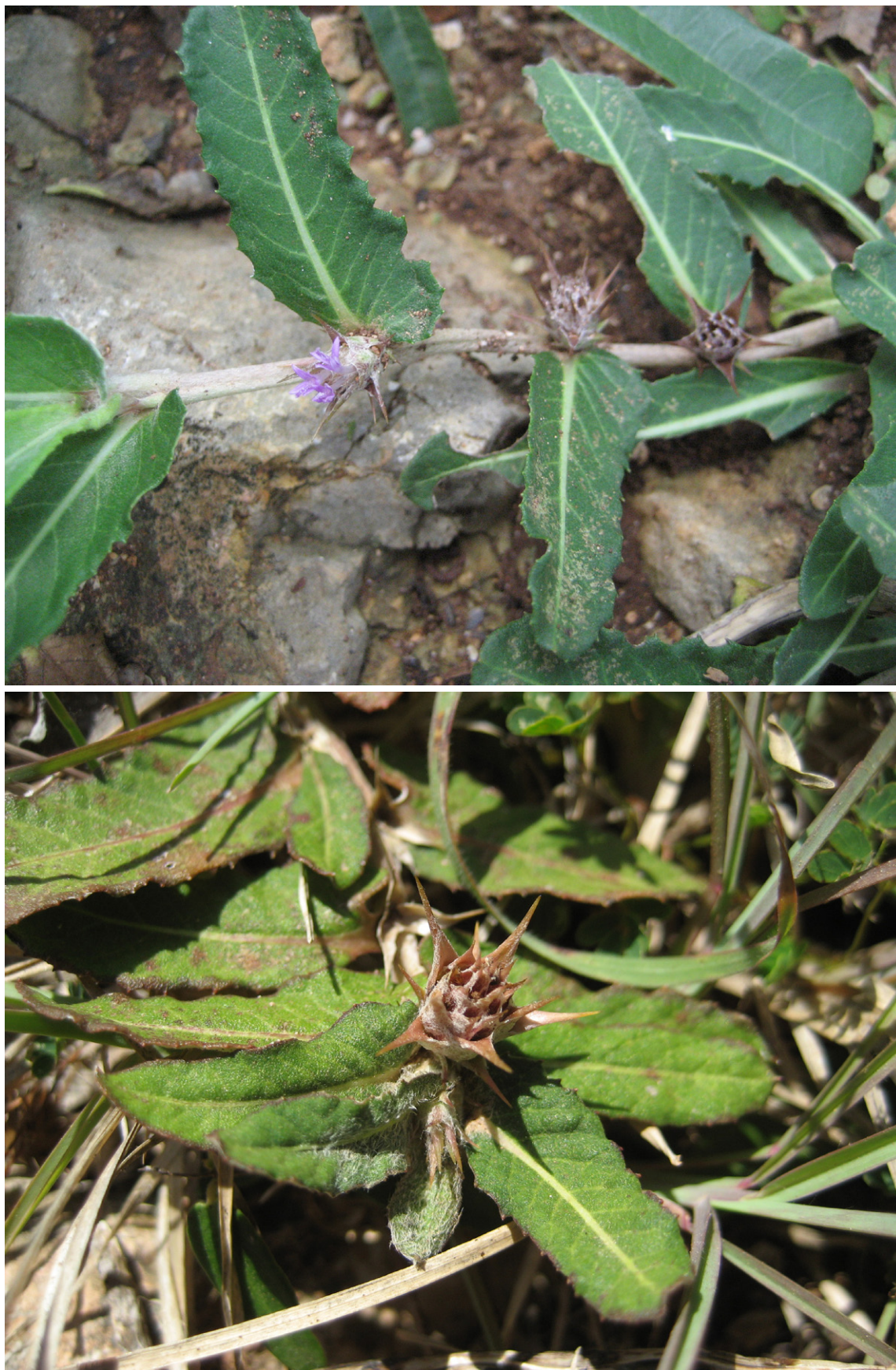
Fig. 1. Acanthodesmos gibarensis at the type locality – A: flowering shoot, November 2011; B: shoot with with mature capitulum, April 2013.