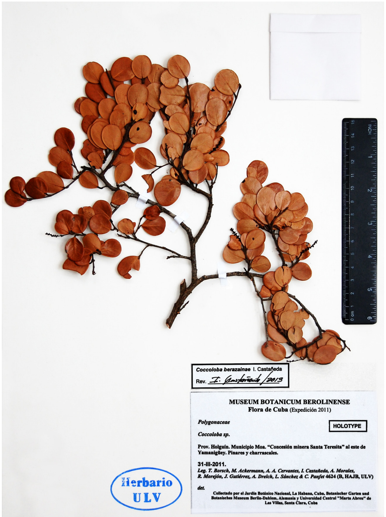
Fig. 1. Coccoloba berazainae – photograph of the holotype specimen at ULV.