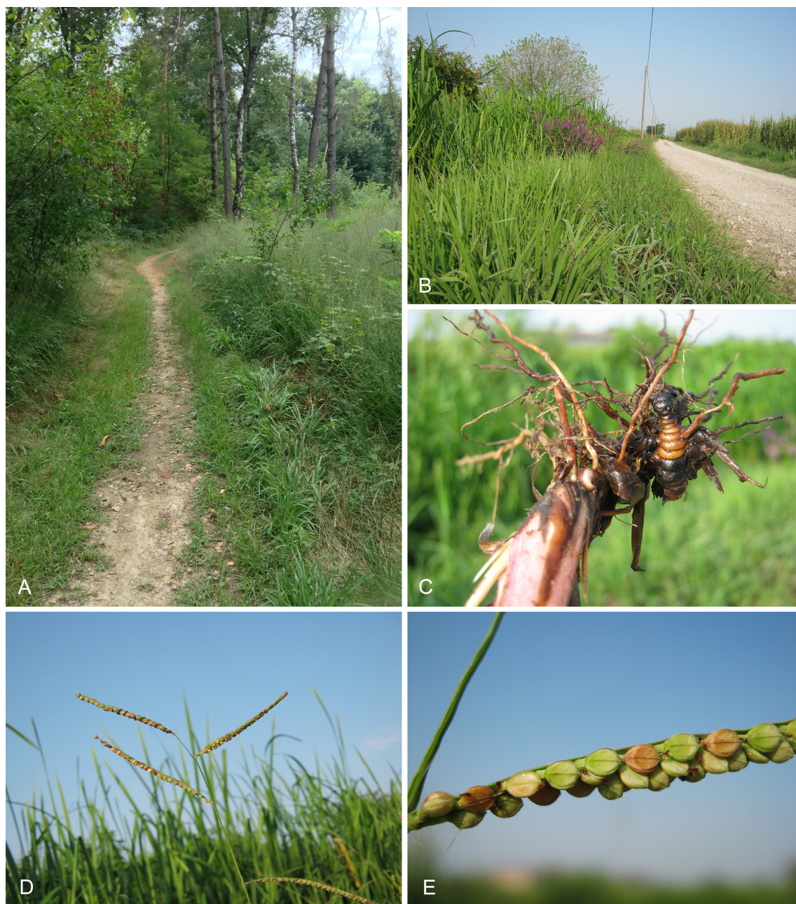
Fig. 1. Paspalum thunbergii in Italy. – A: forest path in Boscaccio; B: roadside ditch in Mortara; C: rhizome; D: inflorescence; E: spikelets. – A: Boscaccio, photographed in August 2015 by Guido Brusa; B–E: Mortara, photographed in August 2015 by Nicola Ardenghi.

pubescent, especially along the margins (vs acuminate at the apex, with long-ciliate margins). Moreover, P. thunbergii typically has upper glumes that are 3-veined with a very prominent central vein and marginal lateral veins (vs 5–7-veined upper glumes in P. dilatatum ). Also, both species are ecologically rather different (see below). Paspalum thunbergii and P. dilatatum locally have likely been confused in Italy or elsewhere in Europe. However, a revision of herbarium specimens of the latter in some herbaria (BER, BR, HBBS, GENT, MSNM, PAV and TO; acronyms according to Thiers [continuously updated]) only yielded one supplementary record of P. thunbergii (see specimens examined).