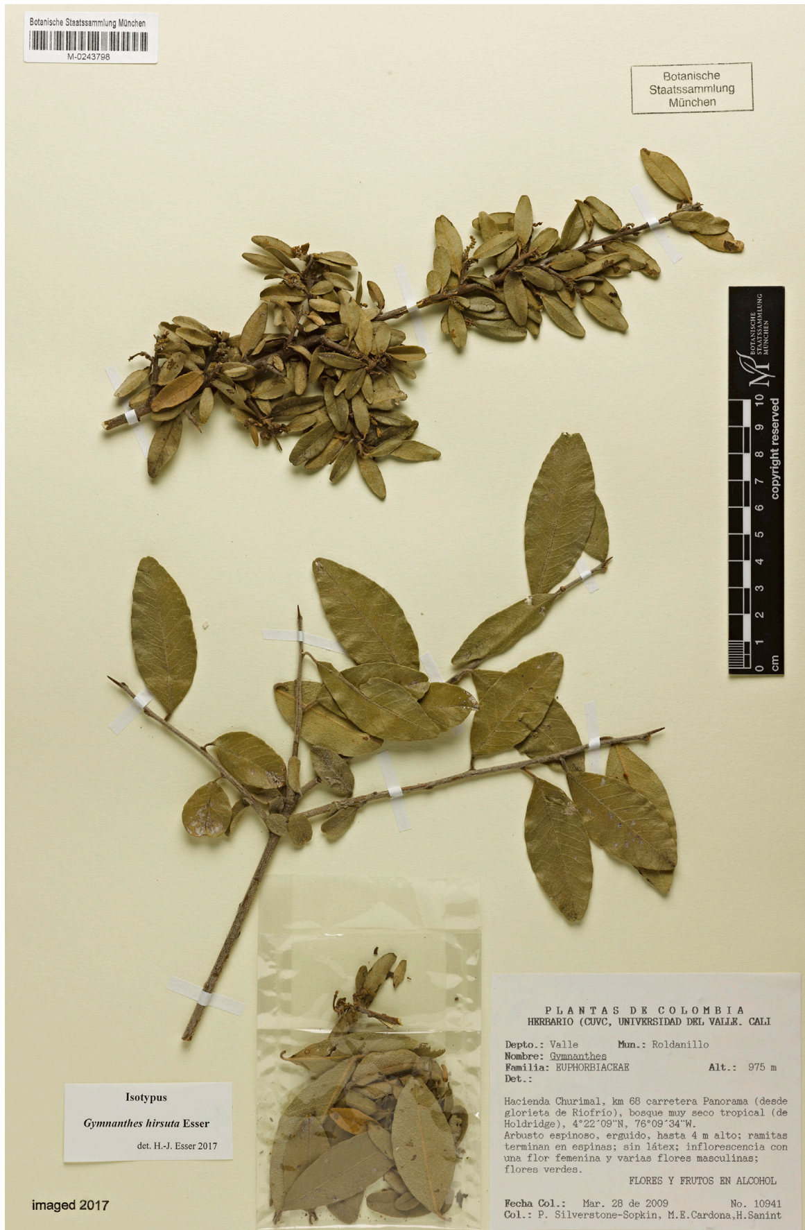
Fig. 1. Isotypus of Gymnanthes hirsuta – Silverstone-Sopkin & al. 10941 (M 0243798).