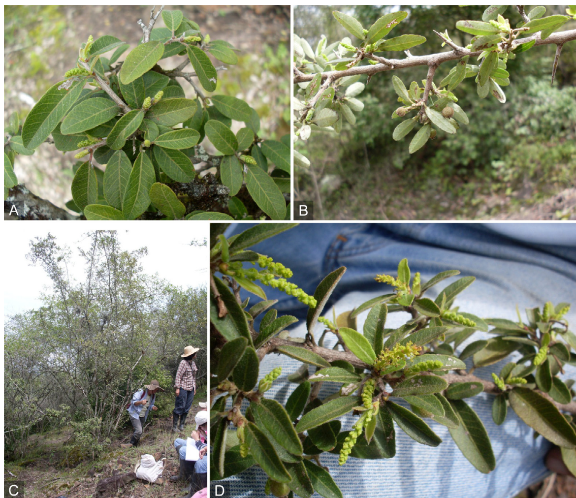
Fig. 2. Gymnanthes hirsuta – A: branch showing leaves from above and inflorescence buds; B: branch showing leaves from below and fruits; C: habit, whole plant; D: detail of branch with open inflorescence. – Colombia, Valle, Mun. Roldanillo, Hacienda Churimal, 28 Mar 2009, photographs by Philip Silverstone-Sopkin.

visible latex, monoecious; lateral branches stiff, terminating in a spine-like, leafless tip, with erect, simple, pale hairs 0.5–0.6 mm long. Leaves alternate; stipules soon caducous and rarely seen, 2–3 × 1.2–1.5 mm, membranous, with scattered hairs, margin entire; petiole 3–7 mm long, hirsute, eglandular; leafblade discolorous, distinctly glaucous-papillate abaxially, elliptic, 2–6.5 × 0.8–2.5 cm, 2.4–2.6 × as long as wide, subcoriaceous to coriaceous, base acute, margin subentire with indistinct teeth, apex rounded-subobtuse; densely to sparsely hirsute abaxially with hairs similar to branches, slightly longer on midrib, with scattered hairs adaxially, dense on midrib, a pair of marginal glands on margin near base, c. 0.35 mm in diam., 0–2 additional glands on each half, otherwise eglandular; lateral veins in 10–12 pairs, not triplinerved, veinlets reticulate, indistinct. Inflorescences axillary, unbranched, reddish in bud, later greenish. Pistillate flowers usually solitary; pedicel c. 4 mm long, hirsute; sepals 3, free, c. 0.25 × 0.25 mm; ovary with 3 carpels, smooth, hirsute; styles free, undivided, c. 2 × 0.25 mm. Staminate inflorescences yellowish, 4–7