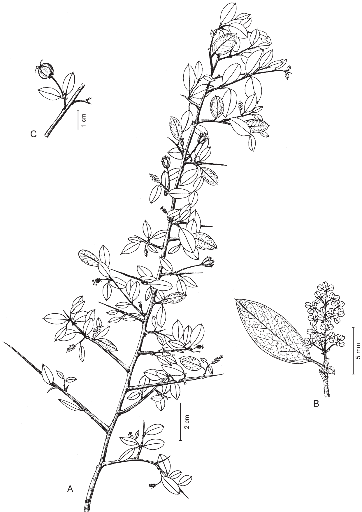
Fig. 3. Gymnanthes microphylla – A: habit; B: staminate inflorescence; C: non-muricate fruit. – All from Wood 21187 (LPB). – Drawn by Carlos Maldonado.