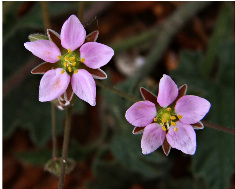
Fig. 1. Flowers of Rhodalsine geniculata from Spain, Lagunas de La Mata, Torrevieja, April 2012