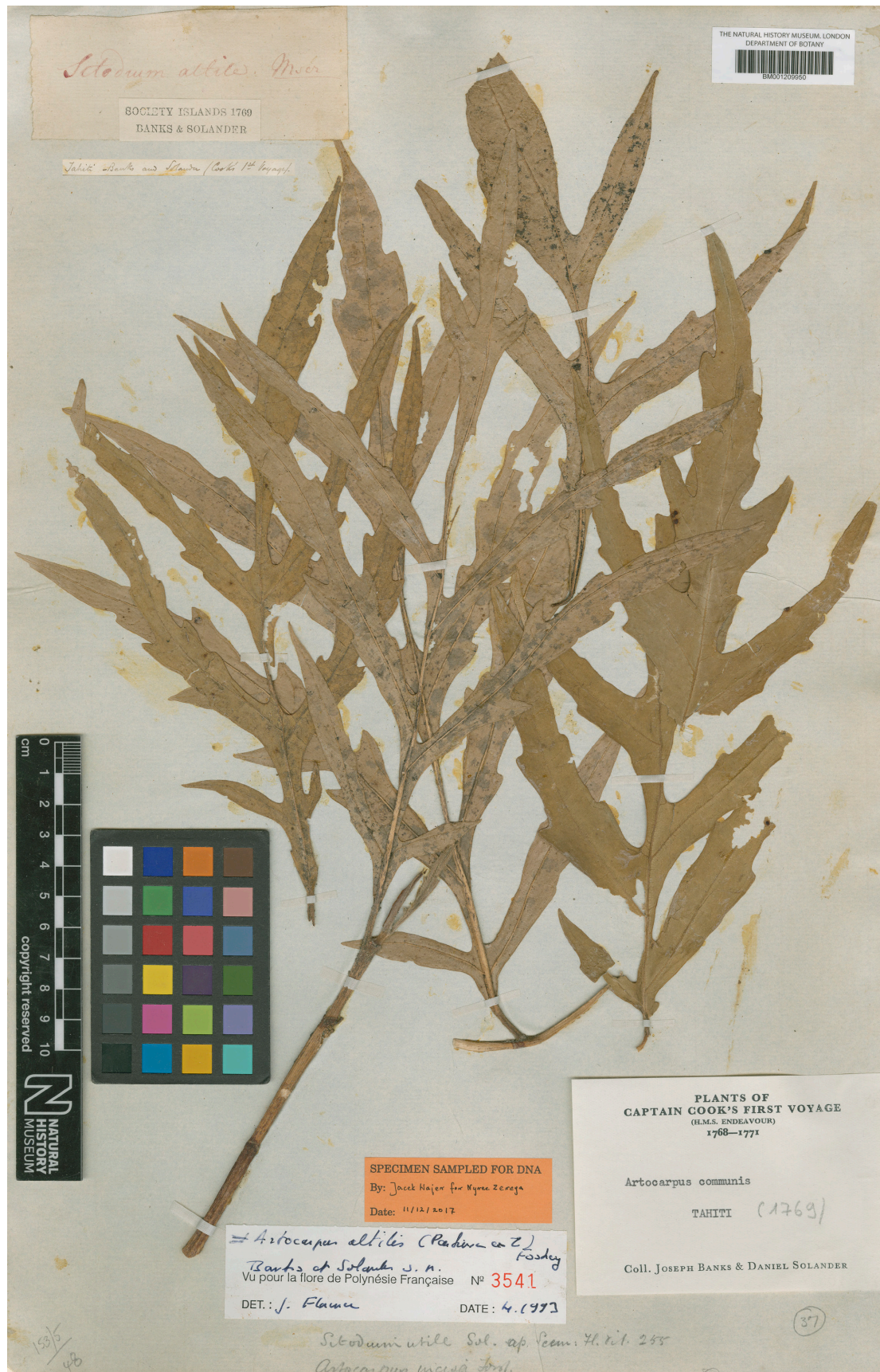
Fig. 2. Specimen of Artocarpus altilis, showing two branches with three leaves, collected by Banks & Solander in 1769 in Tahiti, preserved in BM (barcode BM001209950).