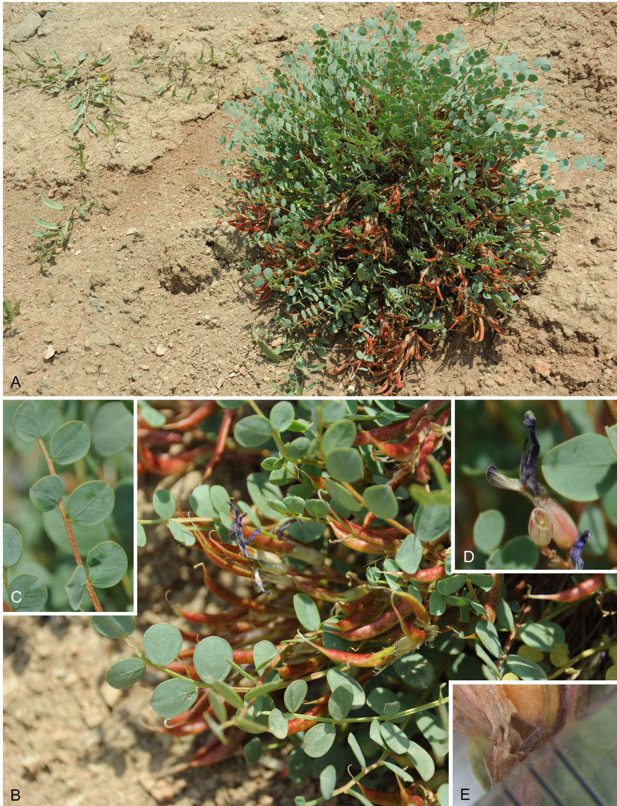
Fig. 1. Astragalus ihsanalisii – A: habit of fruiting plant; B: leaves and infructescences; C: part of leaf, adaxial surface; D: flowers, one truncated; E: stipe of legume. – Type locality, 26 June 2015, photographed by A. A. Dönmez.