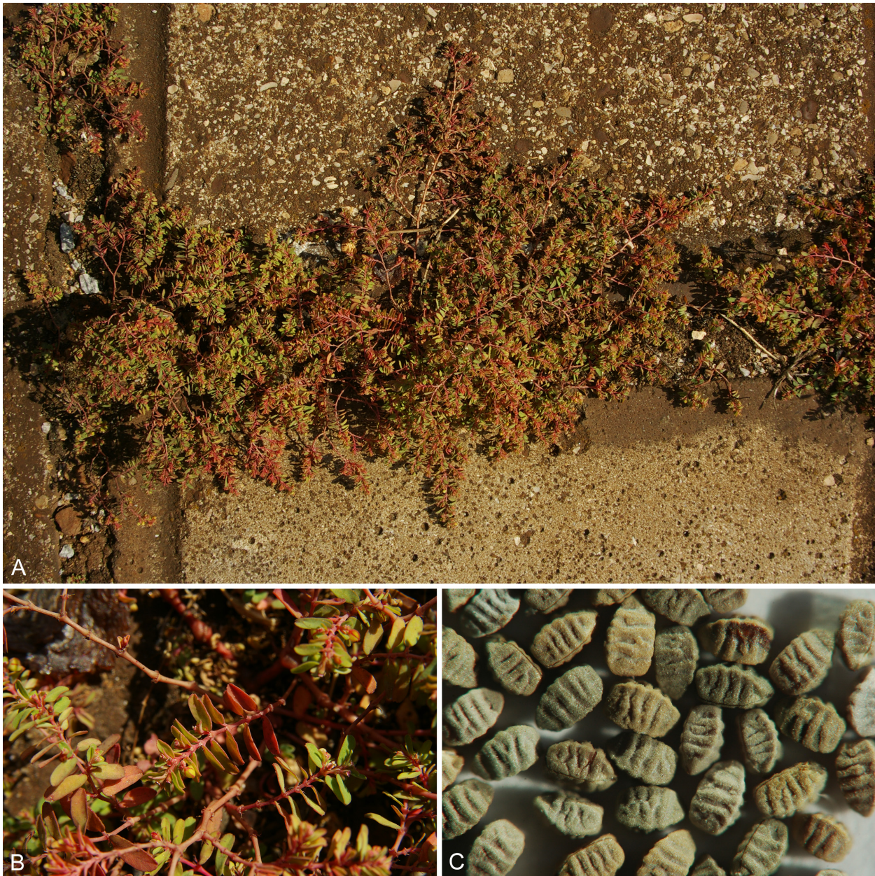
Fig. 4. Euphorbia glyptosperma – A: habit; B: flowering and fruiting shoots; C: seeds. – Crimea: Dzhanikoyskiy district, railway station Solenoe Ozero, 2 Oct 2011, photographs by S. Svirin.

of South America (Peru) and W Asia (Caucasus, Russia) (Govaerts & al. 2019; Geltman & Medvedeva 2017). However, the main area of its introduction is Europe, where E. glyptosperma has been known since the beginning of the 20 th century. This species is currently listed for at least 11 countries of Europe: N (Sweden), C (Austria, Belgium, Hungary, Netherlands, Switzerland), SW (France, Spain) and SE (Italy, Romania, Republic of North Macedonia) (DAISIE 2008+; Somlyay 2009; Geltman & Medvedeva 2017; Randall 2017; Sîrbu & Şuşnia 2018). In E Europe, E. glyptosperma was introduced in the 1980s, but was correctly identified only recently. Now it is recorded in a number of regions