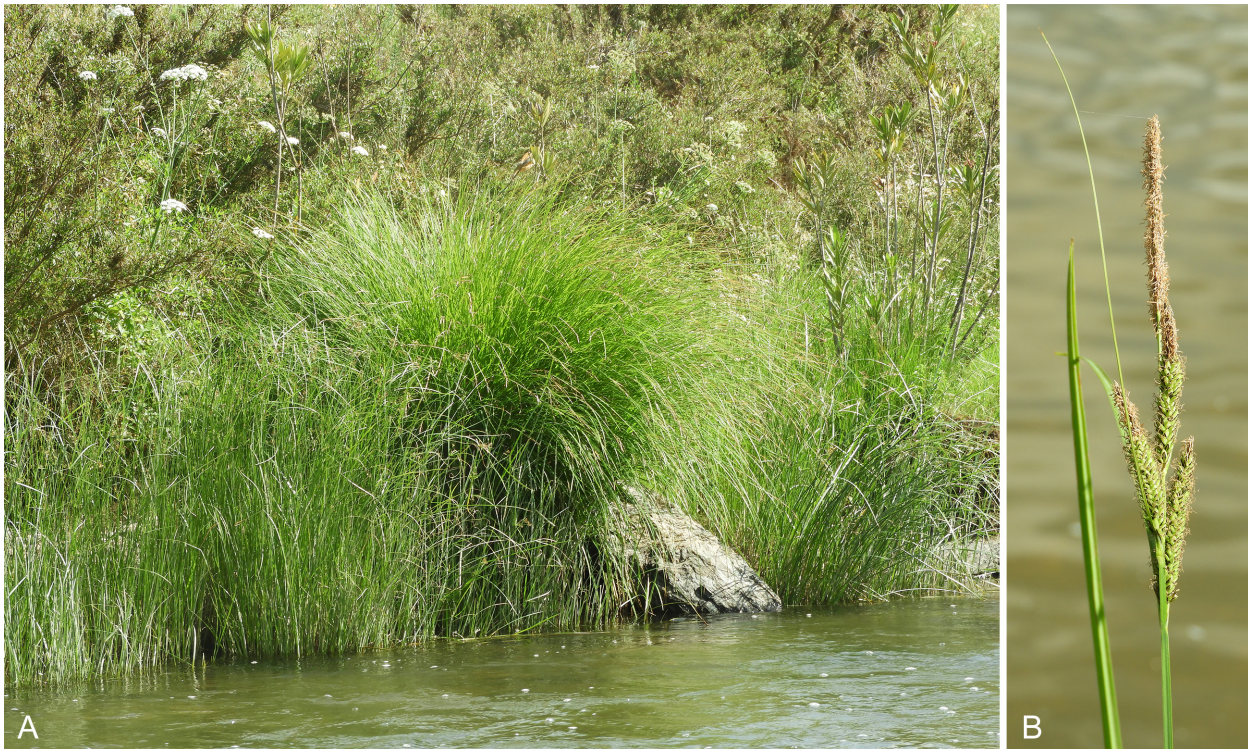
Fig. 3. Carex reuteriana subsp. mauritanica – A: habit and habitat; B: detail of inflorescence with male and androgynous spikes. – Portugal: Alentejo, Baixo Alentejo, Beja district, between Paymogo (Huelva, Spain) and Vales Mortos, international bridge over Chanza river, 21 May 2018, photographs by S. Martín-Bravo.

from C. canariensis by several morphological characters (see Luceño 2008; Molina & al. 2008): leaf size (usually more than 4 mm wide in C. canariensis vs up to 3.5(–4.3) mm wide in C. divulsa and C. pairae ), inflorescence morphology (longer, paniculate and conspicuously branched in C. canariensis vs shorter, spicate, unbranched, or branched only at base in C. divulsa and C. pairae ), and utricle appearance (ovoid to ovoid-lanceolate, conspicuously nerved on proximal half in C. canariensis vs ovoid-elliptic to elliptic and nerveless to faintly nerved at base in C. divulsa and C. pairae ). Therefore, a thorough revision of herbarium specimens (in local Madeiran herbaria or in other herbaria known to include important Madeiran collections such as BM and K) could result in a wider distribution of C. canariensis in Madeira, with historical collections possibly supporting a native status. This would be the 12 th native Carex species reported for the Madeiran archipelago (Jardim & Menezes de Sequeira 2008; Govaerts & al. 2018+). Although the collected specimens were rather immature, the morphology of the Madeiran plants agrees fairly well with its identification as C. canariensis after comparison with representative collections and high-resolution pictures of the type material. Moreover, we have preliminarily as-