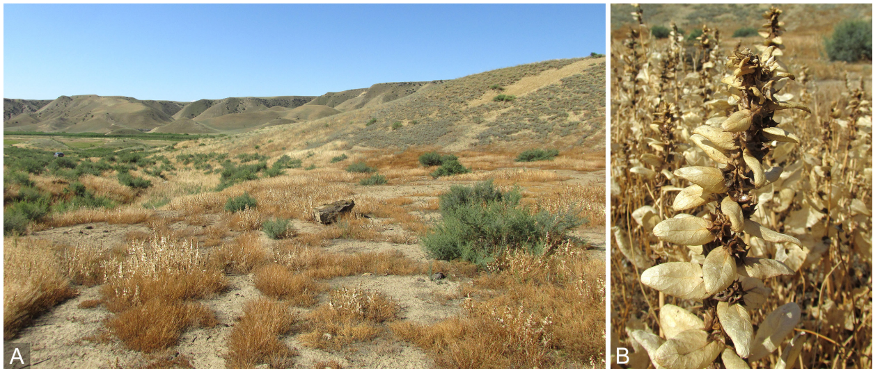
Fig. 1. Spinacia tetrandra – A: habitat; B: upper part of fruiting shoot. – Russia: Dagestan, Derbent district, 4 km W of Muzaim, valley of Kamyshchay river, 13 Jun 2018, photographs by A. V. Fateryga.

anthropogenic influence (Fig. 1A), the species seems to be native for Dagestan.