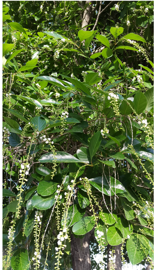
Fig. 5. Citharexylum spinosum – Tunisia: Sousse, Mohamed V, near railroad track leading to Sousse Bab-Jdid station, 26 Jan 2019.