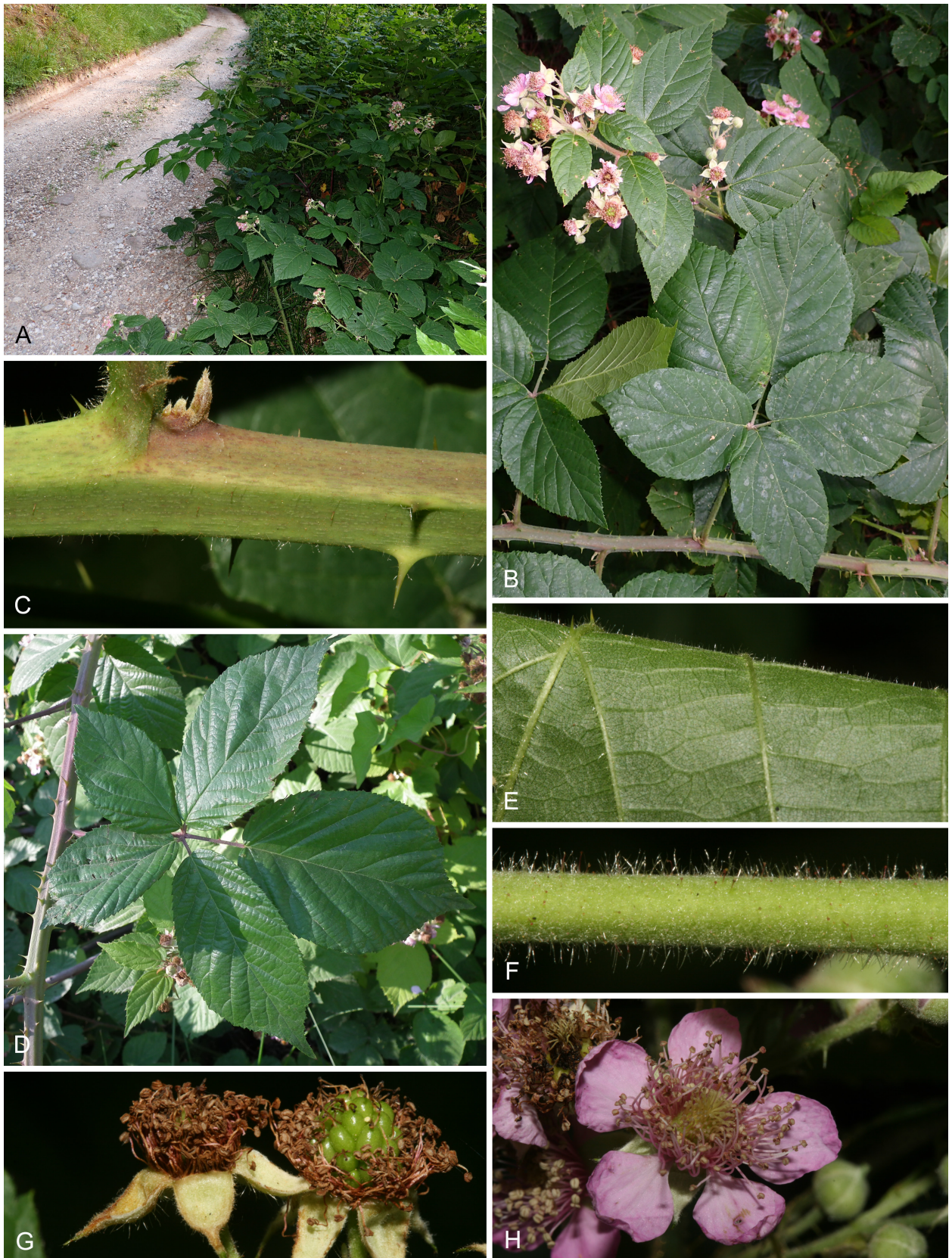
Fig. 2. Rubus vallis-cembrae – A: typical stand in a forest fringe; B: leafy first-year stem and inflorescence; C: first-year stem; D: typical leaf of first-year stem; E: underside of leaf of first-year stem; F: axis of inflorescence; G: young collective fruits; H: flowers. – A–C & E–H: Val di Cembra, near Rio di Lona, 1 Jul 2018, photographed by Filippo Prosser; D: Val di Cembra, 1 km SW of Albiano (type locality), 30 Jun 2018, photographed by Gergely Király.