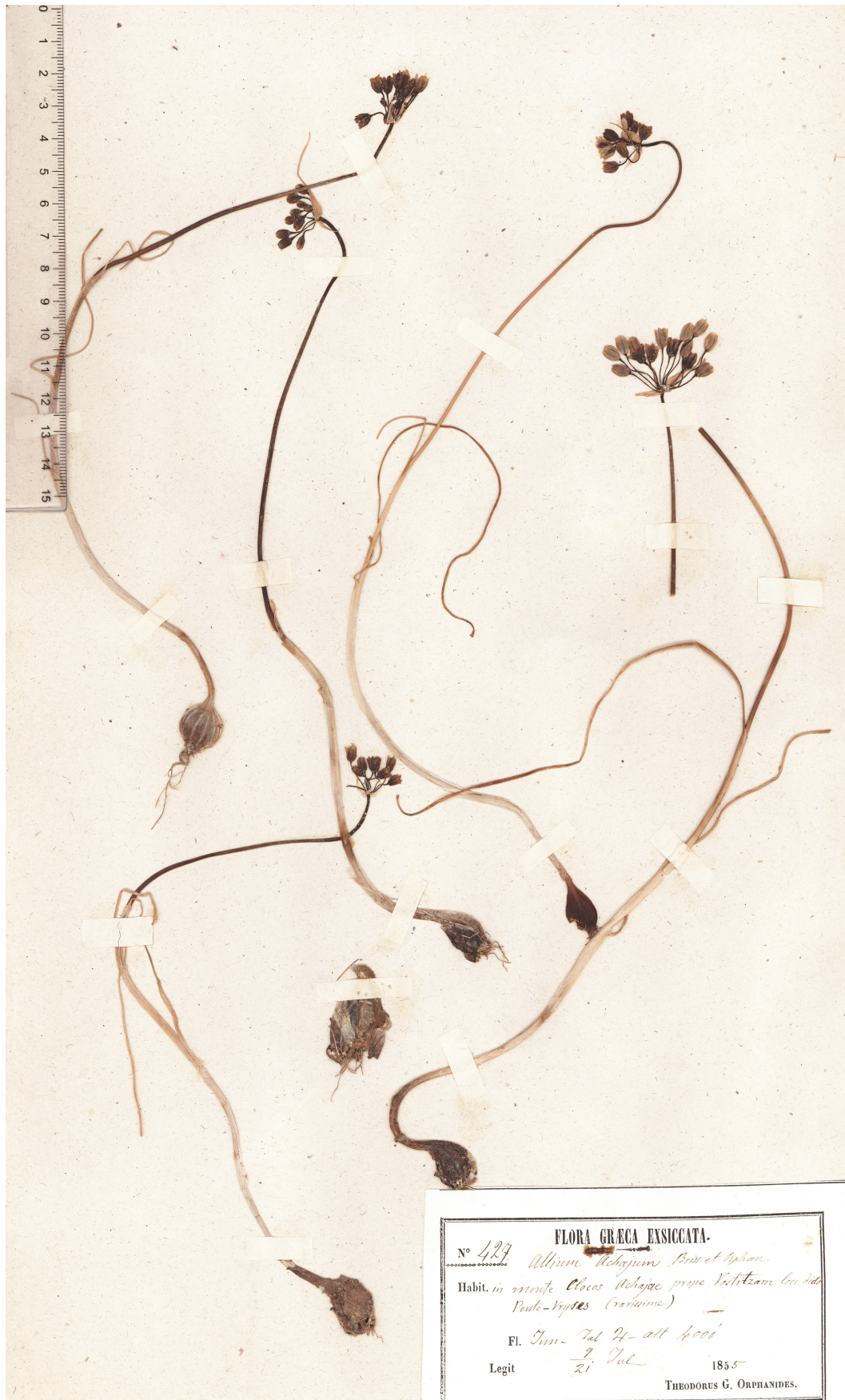
Fig. 5. Isotype of Allium achaium Boiss. & Orph. (in UPA), from the original gathering made by Orphanides in 1855 on Mt Klokos (Achaia, Peloponnisos, Greece). It belongs taxonomically to A. frigidum Boiss. & Heldr. Note the pendulous inflorescences.