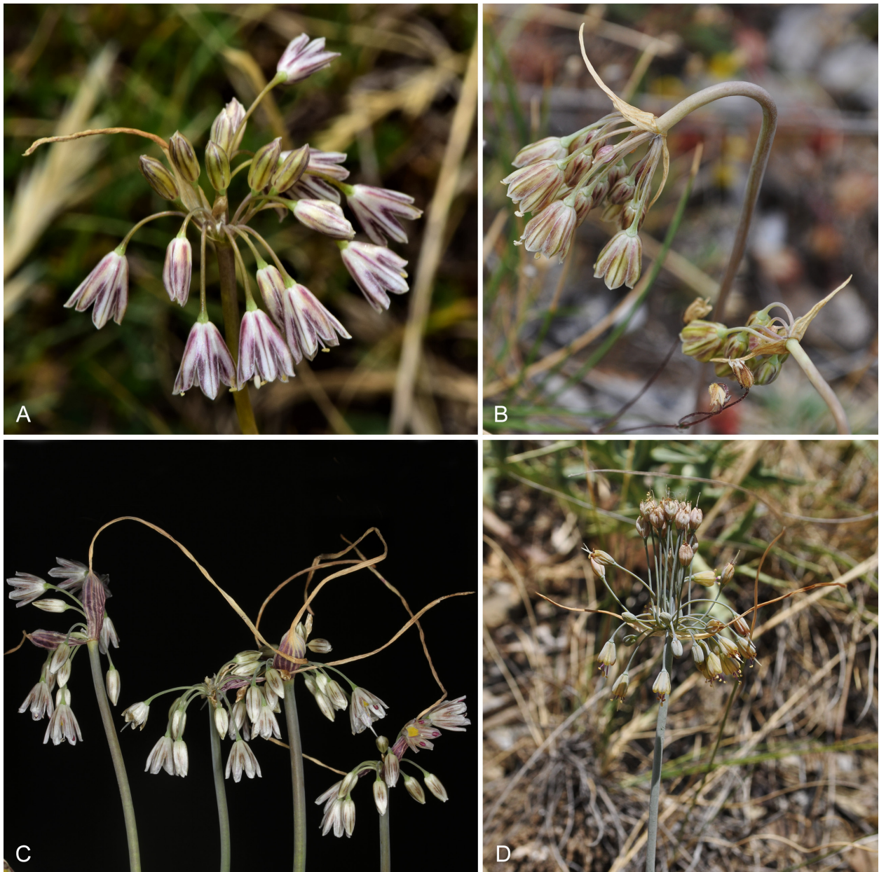
Fig. 1. Inflorescences – A: Allium oreohellenicum from S Pindos (Mt Kakarditsa, 6 Aug 2017, photograph by I. Kofinas); B: A. frigidum from Peloponnisos (Mt Panachaikon, 24 Jul 2014, photograph by D. Tzanoudakis); C: A. parnassicum from Sterea Ellas (Mt Parnassos, 28 Jul 2015, photograph by P. Trigas); D: A. flavum subsp. tauricum from Peloponnisos (Mt Klokos, 11 Jul 2017, photograph by D. Tzanoudakis). – The last (D) erroneously considered by Bogdanović & al (2011) as the “true A. achaium ”.

Stearn (1978, 1980, 1981) and Kollmann (1984: 135). On the contrary, A. achaium has been subsequently reappraised as a distinct species of the Greek flora by Andersson (1991: 709), with the Orphanides gathering from Mt Klokos in G-BOISS as the holotype of the species and its total distribution range indicated from Peloponnisos to the mountains of Sterea Ellas and Southern and Northern Pindos (Thessalia/Ipiros).