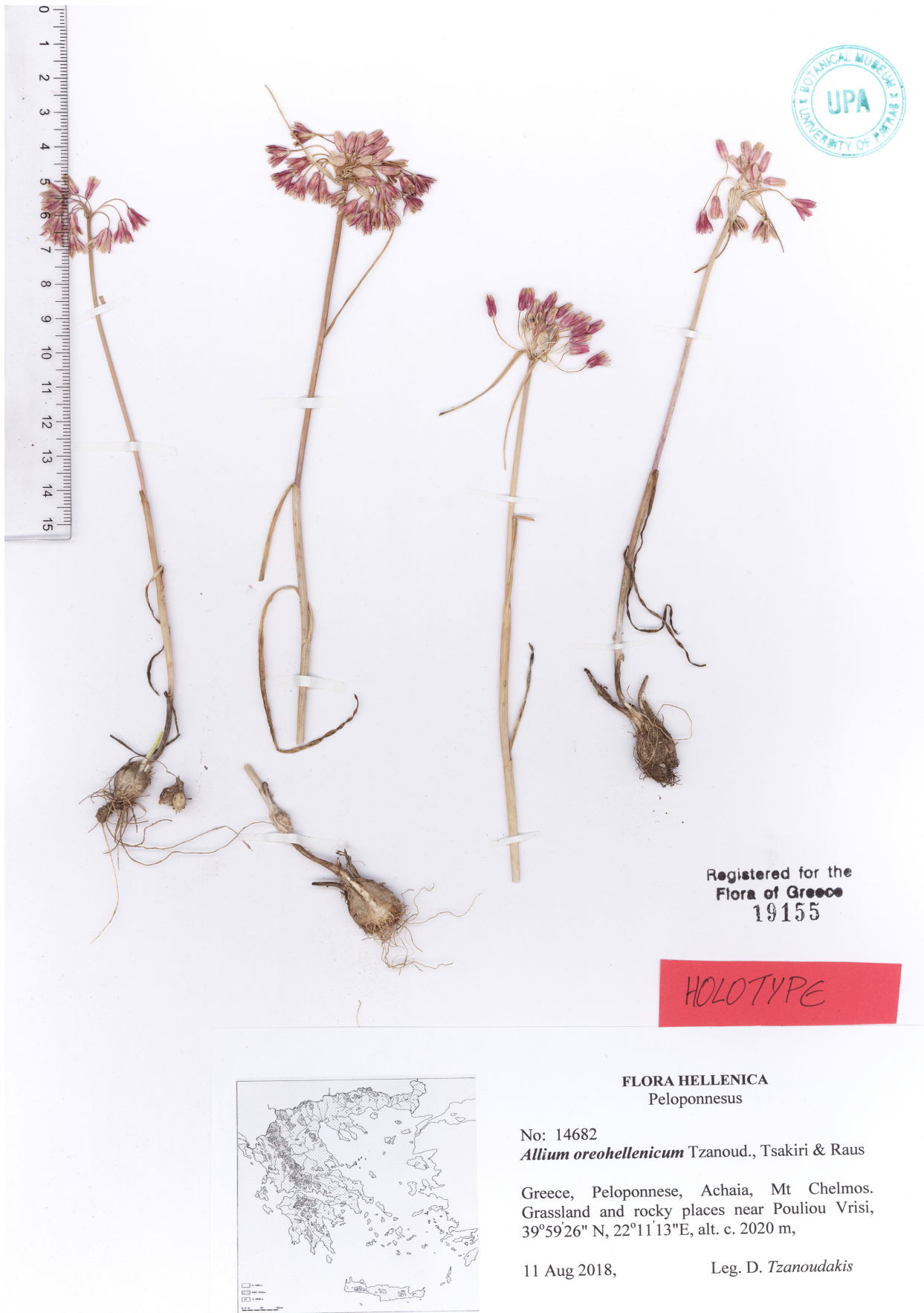
Fig. 4. Holotype of Allium oreohellenicum Tzanoud., Tsakiri & Raus, Tzanoudakis 14682 (UPA).