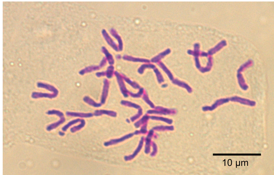
Fig. 3. Metaphase plate of Allium oreohellenicum from the type locality, 2n = 3x = 24 .

There is no doubt that in high-altitude habitats of the mountains of N Peloponnisos one more taxon of the Allium paniculatum group is present, sometimes growing side by side with A. frigidum . It is characterized by having outer bulb tunics often longitudinally splitting into parallel fibres, inflorescence erect (versus pendulous in A. frigidum ), spathe valves longer than the pedicels, perianth segments pinkish white in the living state, to 6(–6.5) mm long, stamens with white-yellowish anthers included in the perianth, and ovary much longer than wide, narrowed at the base and truncate at the apex (Fig. 1A, 2A & 4). Plants with a similar morphology have also been collected in the high mountains of Sterea Ellas and in the Pindos range of NW Greece (Thessalia/Ipiros) and were treated by Tzanoudakis & Vosa (1988)