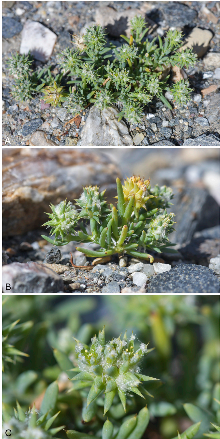
Fig. 1. Gymnocarpos sclerocephalus – A, B: two individuals found in the rambla of Lanujar; note the heterogeneous, stony nature of the soil; C: close-up of the inflorescence; note the tightly clustered flowers, spiny bracts and sepals, and white hairs covering the sepals. – A–C: Spain, Almería, 17 Mar 2018, photographed by F. Le Driant.

The tightly clustered infructescences and the apically spiny sepals suggest an efficient dispersal by epizoochory (Bittrich 1993: 214), explaining the particularly large geographical range of the species compared to other members of the genus and making still