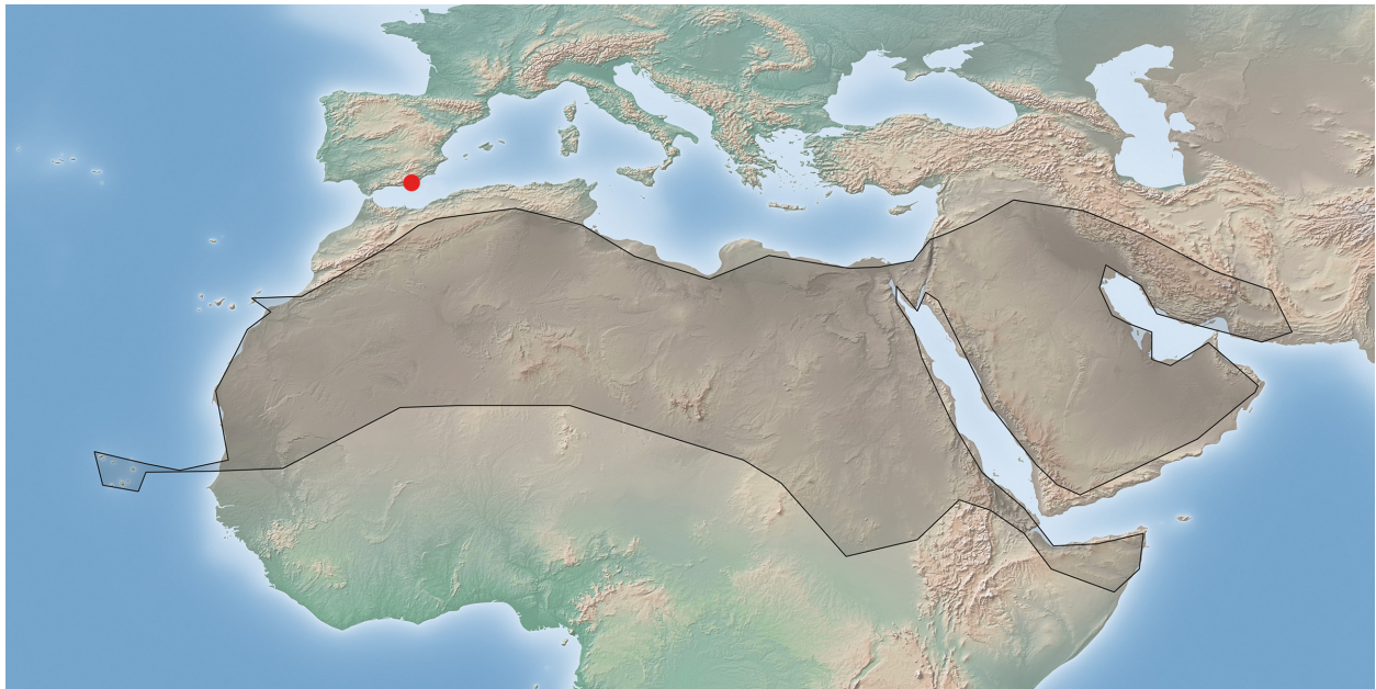
Fig. 3. Map created by combining the fragmentary or imprecise distributional information provided by the Global Biodiversity Information Facility ( https://www.gbif.org/ ) and the Catalogue of Life ( https://www.catalogueoflife.org/ ) with the general map in Jia & al. (2016). The red dot indicates the Spanish localities presented here.

Iran (Fig. 3), and now must be added to the list of genera and species distributed mainly if not only in the Saharo-Arabian region and with their only European populations in the arid areas of southeastern Spain: Ammochloa palaestina Boiss., Anabasis articulata (Forssk.) Moq., Commicarpus plumbagineus (Cav.) Standl., Enneapogon persicus Boiss., Forsskaolea tenacissima , Hammada articulata (Moq.) O. Bolòs & Vigo, Ifloga spicata (Forssk.) Sch. Bip., Koelpinia linearis Pallas, Leysera leyseroides (Desf.) Maire and Notoceras bicorne .