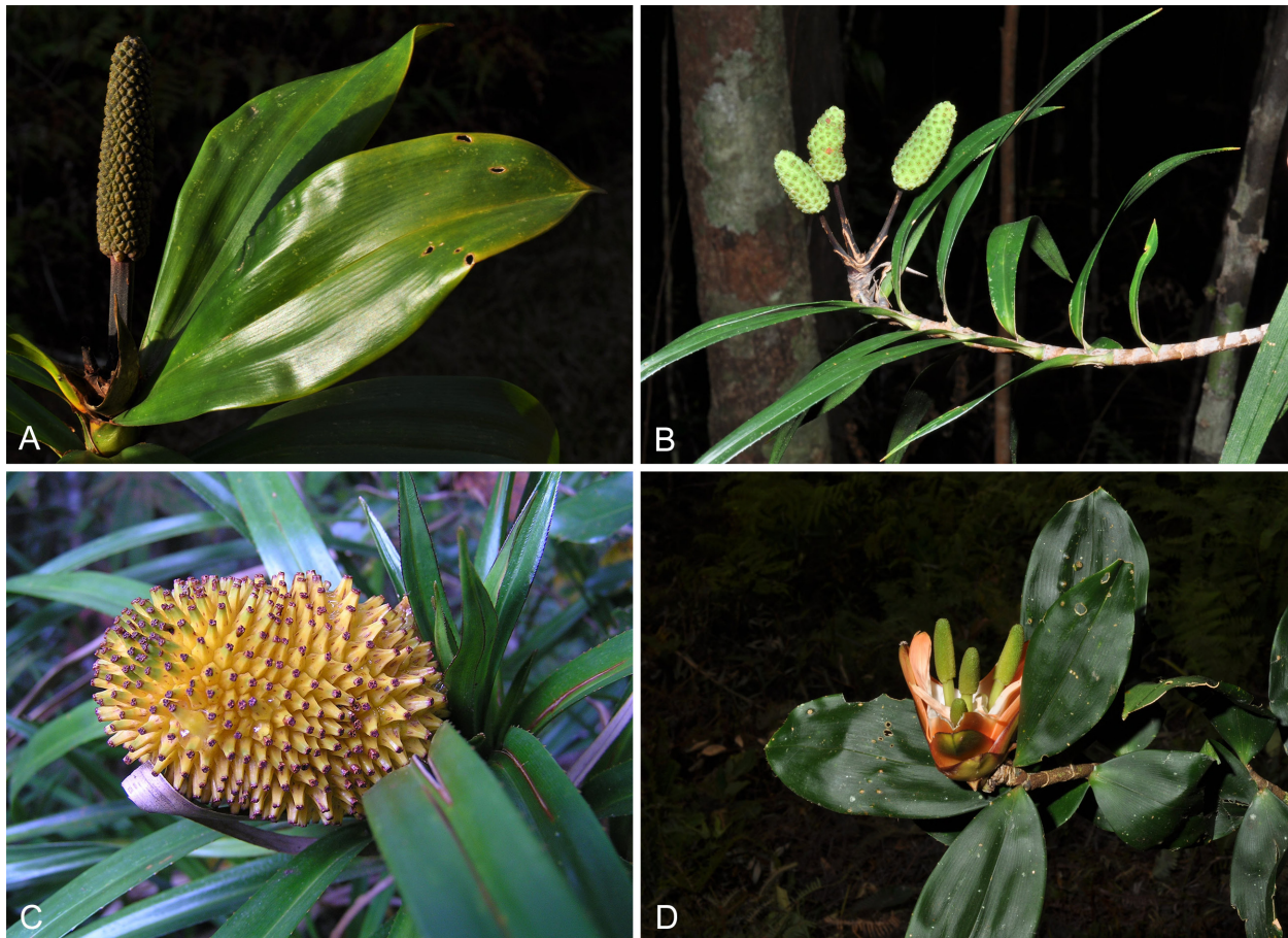
Fig. 2. Photographs of Freycinetia from New Caledonia. – A: F. spectabilis ; B: F. schlechteri ; C: F. sulcata ; D: F. verruculosa . – Source: A: Munzinger & al. 5834; B: Callmander & al. 891; C: Barrabé 283; D: Callmander & al. 898.

Minahassa, s.d., Warburg s.n. (B barcode B 10 0367712!; isotype: FI barcode FI017791!).