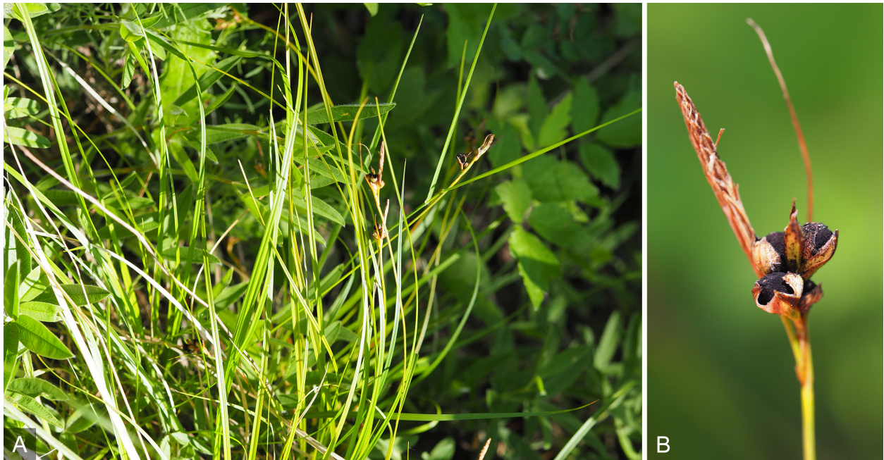
Fig. 2. Anthracoidea hallerianae on Carex halleriana . – A: infected plant; B: close-up of infected female spike. – Photographs: Bulgaria, type locality, 13 Jun 2019, T. T. Denchev.

protuberances (up to 5 \mu\text{m} thick), sometimes with 1 or 2(–4) internal swellings (variable in conspicuousness), light-refractive areas often present; minutely to moderately verruculose, warts up to 0.4(–0.5) \mu\text{m} high, spore profile not affected to slightly affected. In SEM, warts sometimes partly confluent, forming short rows or small groups. Spore germination unknown.