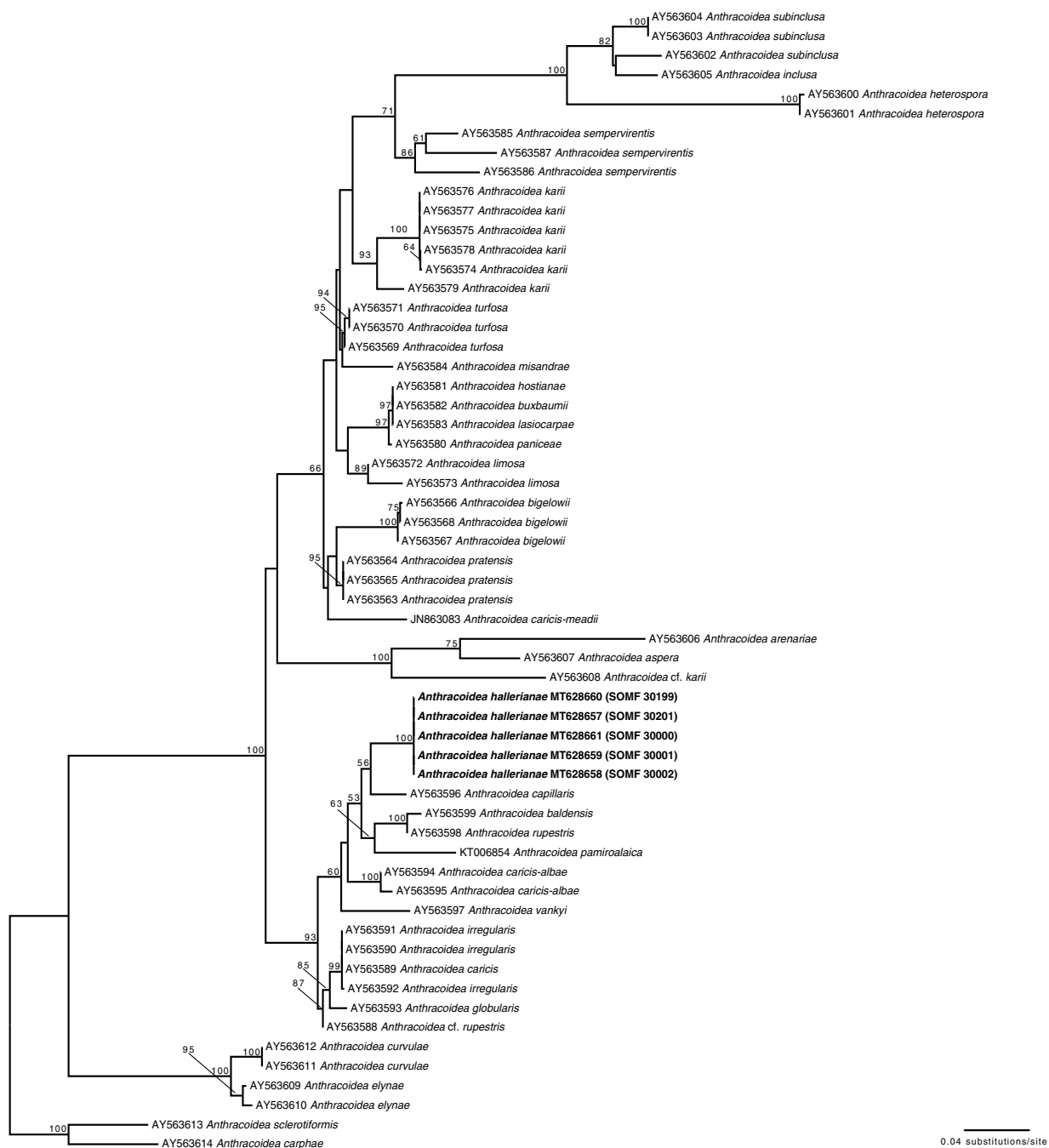
Fig. 1. Best tree of the RAxML analysis of species in the genus Anthracoidea based on a MAFIT alignment of partial LSU rDNA data. Bootstrap values \geq 50 are depicted above the branches. The phylogeny is rooted with A. sclerotiformis and A. carphae according to Hendrichs & al. (2005).

Holotype: on Carex halleriana Asso, Bulgaria, Pernik Province, Mt. Vitosha, above the entrance of Douhlata cave near Bosnek village, 42°29'46"N, 23°11'45"E, alt. 930 m, 13 Jun 2019, T. T. Denchev & C. M. Denchev 1918 (SOMF 30000).