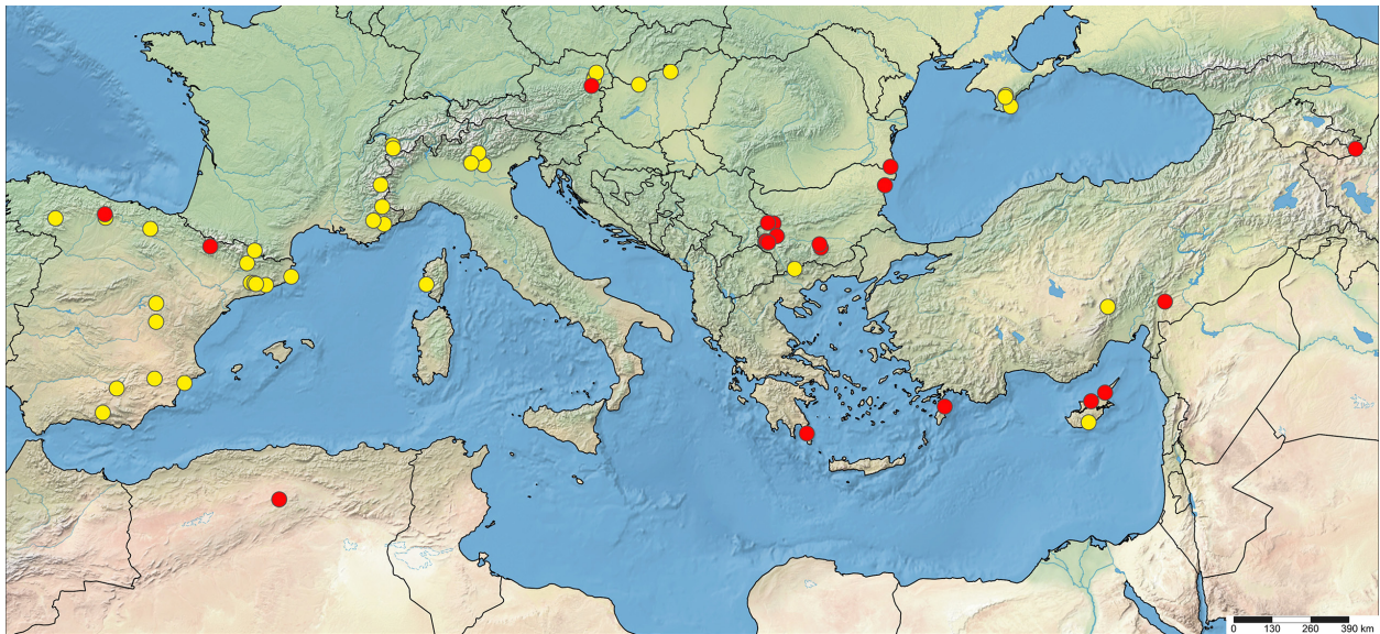
Fig. 4. Geographic distribution of Anthracoidea hallerianae . – Red circles = examined specimens; yellow circles = literature records. – Map generated with SimpleMappr (Shorthouse 2010).