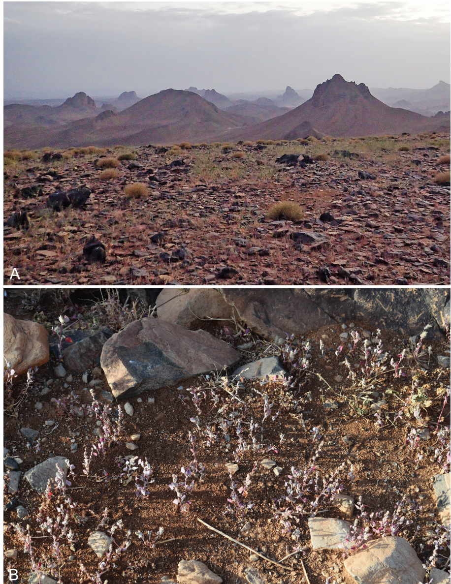
Fig. 5. A: Algeria, rocky plateau of Assekrem, 2700 m, view to south, 24 Oct 2019; B: same locality, habitat of Chenopodium hoggarens , 24 Oct 2019.

Because there are some doubts about the identity of Chenopodium vulvaria var. incisum , its position is left open here.