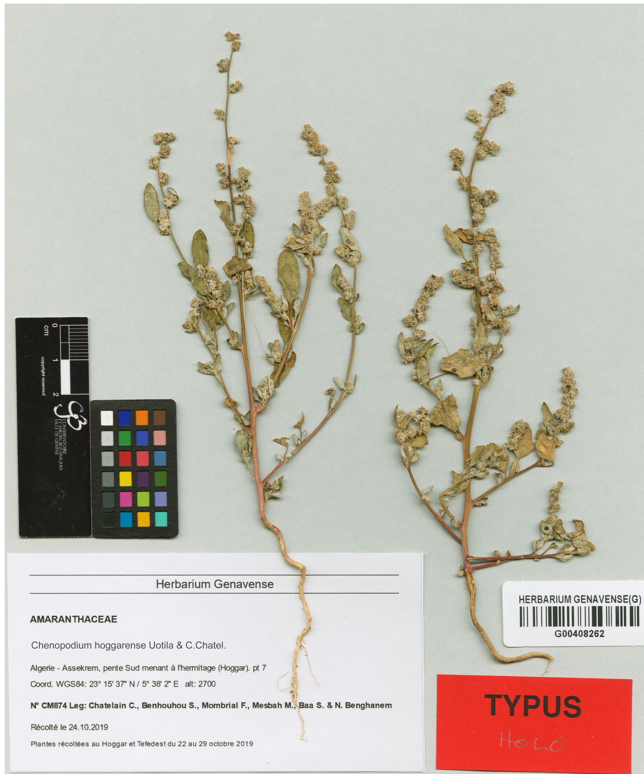
Fig. 1. Holotype of Chenopodium hoggarens (G [G00408262]).

gin entire or with a few obscure teeth, apex acute to mucronate to cuspidate; upper leaves narrowly elliptic to lanceolate (Fig. 3A). Inflorescence occupying most of plant height, composed of paniculately arranged, mostly well-spaced, dense glomerules, mostly leafless in upper 1/3 of stem and branch length, in leaf axils in lower parts. Perianth lobes 5, basally united for 1/4–2/5 of their length,