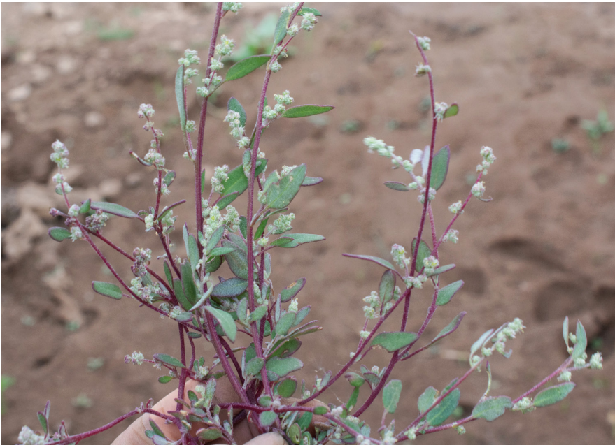
Fig. 2. Chenopodium hoggarens , flowering and fruiting branches. – Algeria, rocky plateau of Assekrem, 2700 m, 24 Oct 2019, photograph by S. Benhouhou.

pericarp fairly thin, quite easily scraped off. Seeds lenticular with weakly acute margin, 1.2–1.3 × 1.1–1.2 mm, 0.4–0.5 mm thick, testa finely radially rugose to almost smooth.