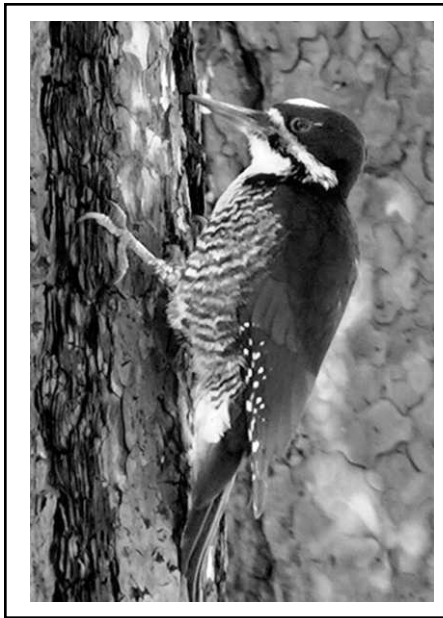
Figure 3. Black-backed woodpecker – a fire dependent species in the Sierra.

Black-backed Woodpeckers have become increasingly rare because their optimal habitat has shrunk to a fraction of its historical extent (Figure 2 a – d); populations are estimated at <700 nesting pairs in burned forests (Bond et al. 2012). Importantly, the CESF habitat that the remaining pairs depend on has little or no protection on public lands managed by the U.S. Forest