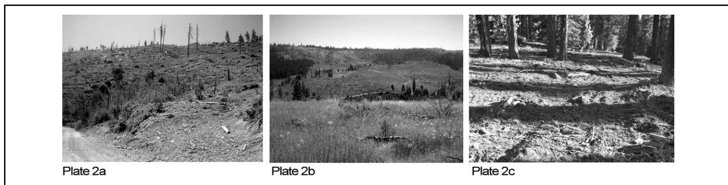
Photo Plate 2. Postfire logged portions of Fred's fire in the Eldorado National Forest, CA, showing lack of nitrogen-fixing shrubs (a) and presence of Klamath weed ( Hypericum perforatum ) and many readily ignitable, invasive grasses (b); (c) simplified system from Dinkey post-fire thin on west slopes of Southern Sierra.

(Table 1). When logging compounds the natural disturbance that created a CESF (Photo Plates 3a, 3b, 3c), each of these attributes is reduced or eliminated (Table 1). Such multiple disturbances often lead to alternative successional pathways, or loss of resilience (Paine et al. 1998; Odion and Sarr 2007), as has been documented in the Sierra Nevada following post-fire logging, which leads to dominance by the non-native ecosystem transformer, cheatgrass ( Bromus tectorum , Linnaeus) (McGinnis et al. 2010).