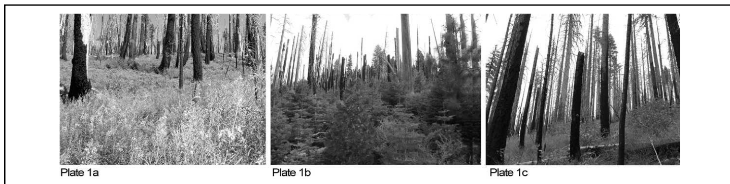
Photo Plate 1. Star Fire of 2001, Northern Sierra, CA. (a) unmanaged with forbs (Doug Bevington, 2008); (b) natural conifer re-establishment (Chad Hanson, 2012); Storrie fire of 2000, Southern Cascades, CA. (c) unmanaged with snags and forbs (Chad Hanson, 2007).

Photo Plates. Extensive biological legacies, abundant forb cover, and abundant conifer regeneration present in complex early seral forests vs. early seral that has been post-fire logged. Post-fire logging in the Sierra Nevada and elsewhere sets back ecosystem processes creating a successional debt.