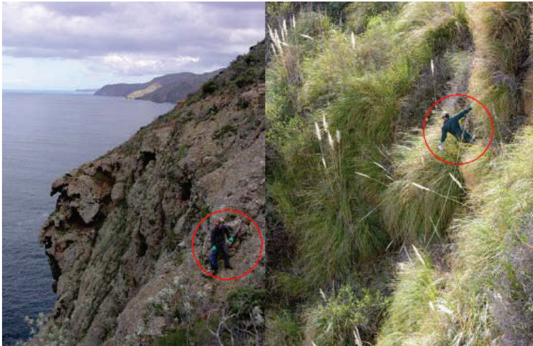
Fig. 2. Technician treating pampas grass on steep cliffs on Santa Cruz Island.

active weed populations decreased and the efficiency gained by using the helicopter increased, more populations of these weeds, along with more weed species (2 in 2011 and 3 in 2012), were added to the eradication list and treated. The number of treated (active) or monitored (dead) populations increased to 784 in 2011 and finally to 882 in 2012. Despite more than doubling the number of targeted weed populations, the annual cost decreased by approximately 50% over 6 years due to treatment efficacy and efficient implementation. We estimated that between 12 and 15 weed populations could be treated in a day by one weed technician. It generally took more time to relocate dead infestations which had either washed or withered away and to confirm that populations presumed to have been eradicated had not emerged from the seed bank than it did to relocate and treat active weed populations.