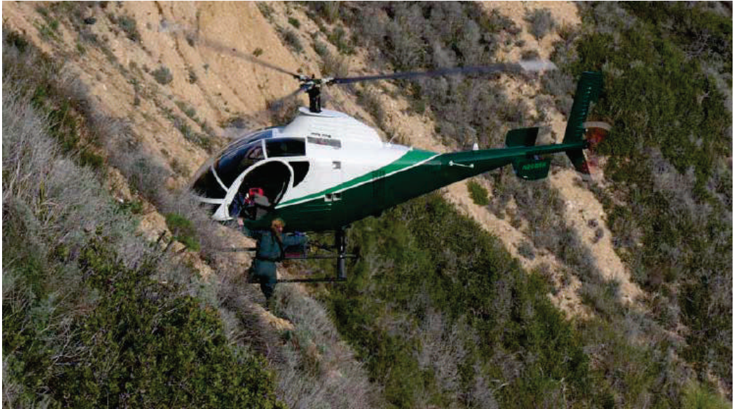
Fig. 1. Helicopter delivering technician to weed infestation in rugged terrain on Santa Cruz Island.

30 m (100 ft.) was designated a separate population (infestation).