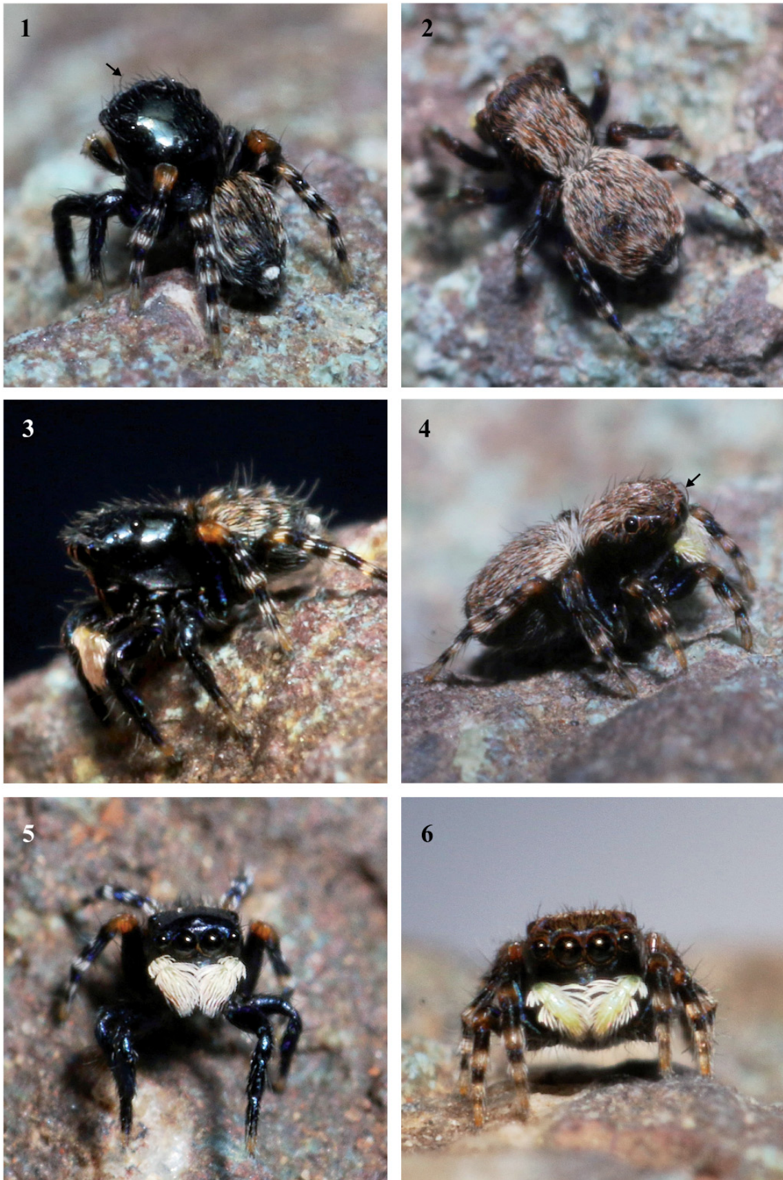
Figs 1-6. Photographs of living individuals of Tanzania yellapragadai sp. nov.; dorsal view (1-2), lateral view (3-4), frontal view (5-6). (1, 3, 5) Male holotype. (2, 4, 6) Female paratype. Arrows indicate enlarged clypeal setae.