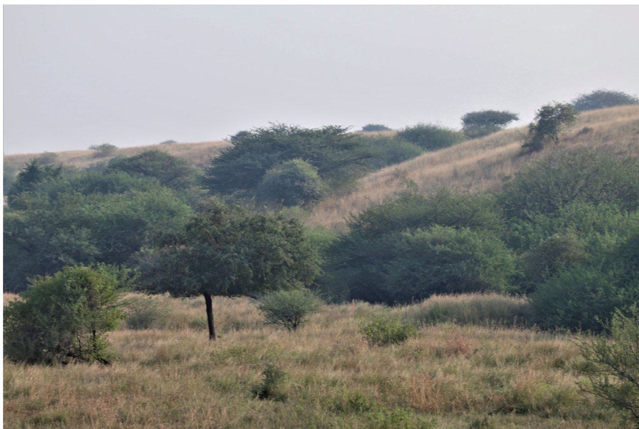
Fig. 13. Habitat at the type locality.

Palp 0.57 [0.23, 0.08, 0.07, 0.19], I 1.10 [0.37, 0.17, 0.24, 0.19, 0.13], II 1.01 [0.34, 0.15, 0.21, 0.17, 0.14], III 1.48 [0.56, 0.18, 0.32, 0.24, 0.18], IV 1.38 [0.46, 0.14, 0.35, 0.22, 0.21]. Leg formula: 3412. Spination: palp spineless; legs: femora I-IV 0000; patellae I-IV 0000; tibia I 0003, II 0001, III 0010, IV 0000; metatarsus I 0004, II 0013, III 2022, IV 1021; tarsi I-IV 0000. Epigynal openings with spiral ridge, separated from each other (Fig. 11). Spermathecae bean-shaped, with simple copulatory duct arising anterolaterally (Fig. 12).