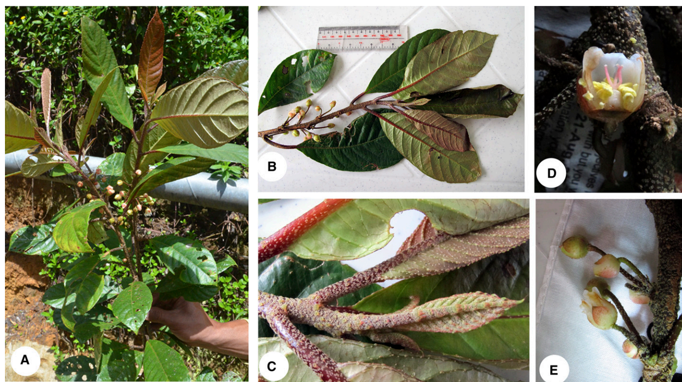
Fig. 1. Photographic set of Saurauia negrosensis Elmer (Actinidiaceae), specimen Chua 002. (A) Habit. (B) Leaves and flower position, scale. (C) Twig apex and glands. (D) Dissected flower. (E) Flower arrangement at old leaf scars.

according to the study by Philipson (1979). Specimen Chua 024 was readily identified to the variable and widespread montane species Arisaema polyphyllum (Blanco) Merr. (Araceae) by comparison with the well-distributed specimen Merrill: Species Blancoanae No. 460. Specimen Chua 028 was easily identified to Aquilaria cumingiana (Decne.) Hallier f. (Thymelaeaceae), a singular relative of the agarwood or gharu trees that is widespread and abundant in the Philippines.