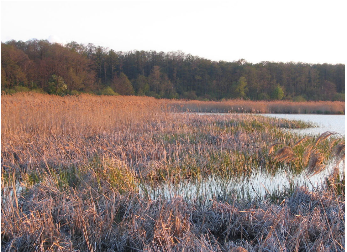
Figure 2. A typical nesting habitat of Great Bittern on ‘Wydra’ pond (3.3 ha), Samokłęski Common Carp fishpond complex, eastern Poland. The emergent vegetation surrounding the open water pools is dominated by Common Reed and Reed Mace.

(55 nests), the egg laying period (24) and the nestling period (5). All 84 active nests were further visited at least once a week from the end of April to early July to get data on egg-laying, clutch size, hatching date and productivity (mean 4 controls, range 1–9). To reduce the impact of nest visits on predation risk, the number of controls was reduced to a minimum, especially in the incubation stage. In order to estimate observer effect, I compared the daily survival rate (see Data analysis) between highly disturbed (2–4 visits during incubation) and disturbed (one visit) nests. Survival rate of disturbed ( 97.68 \pm 0.006\% ) and highly disturbed nests ( 98.71 \pm 0.004\% ) did not differ statistically ( Z = 1.536, P = 0.124 ).