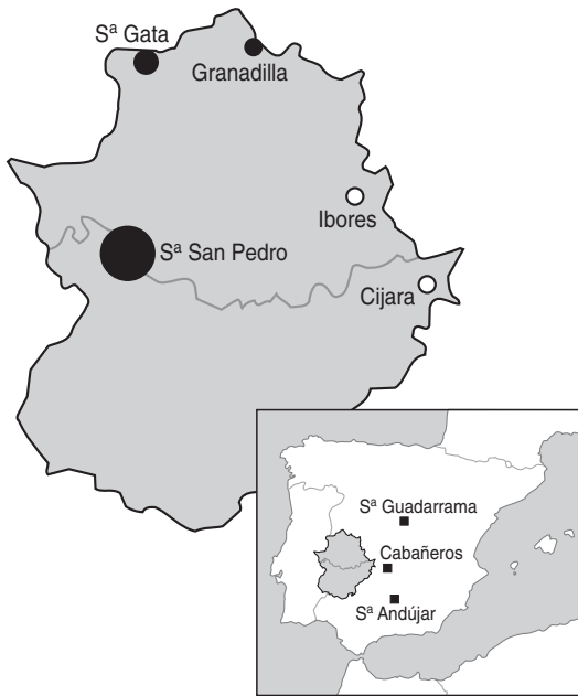
Figure 1. Map of Extremadura (Spain) and Iberian Peninsula showing the location of the studied colonies. Colonies in Extremadura are indicated by circles (closed: colonies included in analyses; open: colonies not included in analyses), and by squares in the rest of the Iberian Peninsula. Cabañeros data (Guzmán & Jiménez 1998); Sierra de Andújar data (Moleón et al. 2001); Sierra de Guadarrama data (Grefa 2004).

second the numbers were 0.12 and 3.17 km, respectively. For comparison, the furthest distance between nests of the whole San Pedro colony was greater than 50 km.