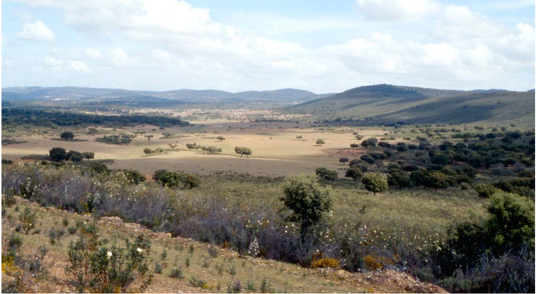
Figure 4. Typical habitat of Cinereous Vulture in Sierra de San Pedro with the nesting area (at the right) and feeding area (at the left).

Junta de Castilla y León, Regional Authorities of Castilla y León). In the Extremadura, domestic pigs and Wild Boar are abundant but their relative importance in the vulture's diet is difficult to assess because of problems of differentiating them in pellets. The pig-farming sector in Extremadura is represented by 1.3 million animals, mostly in a free-range regime in the proximities of vulture colonies (MAPA 2002). The situation of Wild Boar is similar to that described above for Red Deer (Saez-Royuela & Telleria 1986, León 1991).