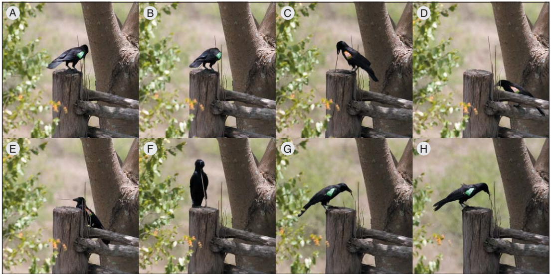
Figure 1. A wild New Caledonian Crow (ID-code is 'HC3'; 6 November 2007) using two dry grass stems as tools for foraging on a wooden fencepost. 12:15:48 – First photo of crow taken on the fencepost; the bird has no tool in its beak. 12:15:53 – HC3 moves to another part of the fence; still no tool. 12:16:09 – HC3 moves to the top of one fencepost with a grass-stem tool (tool A) and proceeds to probe with this tool for c. 5 seconds (A to C) before placing it on the surface of the post (from where it falls to the ground; tool A could not be recovered as it had fallen amongst other pieces of dry grass); HC3 appears to look down into the crevice. 12:16:23 – HC3 has moved from the fencepost to an adjacent (c. 30 cm) horizontal fence section (D), where it is within reach of a large bundle of dry grass stems. 12:16:31 – HC3 manufactures tool B by breaking off a long section of a dry grass stem and shortening it (the missing section can be identified by comparing (D) and (E)). 12:16:33 – HC3 returns to the top of the fencepost and resumes probing into the crevice with tool B (E). 12:16:39 – HC3 looks down into the crevice, with tool B still inserted; it then resumes probing with tool B (F). 12:16:43 – HC3 leaves tool B in the crevice and picks up the first lizard with its beak (G), holding it in the beak for c. 30 seconds before swallowing it head-first. 12:17:28 – HC3 resumes probing into the crevice with tool B. 12:17:45 – HC3 catches a second lizard, and draws the lizard and tool B together out of the crevice (H). 12:17:54 – HC3 places tool B (which is now shorter and without node; see Fig. 2) and the second lizard on the surface of the post and disentangles them by using its left foot to secure the tool and its beak to restrain the lizard. 12:17:58 – HC3 swallows the second lizard head-first and flies off, leaving tool B on the post (tool later recovered; see Fig. 2).

minutes, during which time 45 photos were taken. Such sustained, close-up observation of tool use by wild crows is rare, without the use of either a hide at a baited site, or remote telemetry (see Rutz et al. 2007). The bird, an adult male, had been trapped on 15 December 2006, when it was marked with wingtags, rings and a tail-mounted video-tag; the latter was shed prior to the present observation.