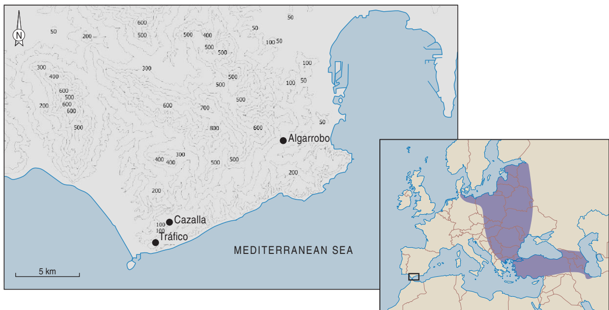
Figure 1. Breeding range of Lesser Spotted Eagle (modified from Riede 2004), study area and observatories used in the monitoring program. Altitudinal lines (m) are indicated.

From 1998 to 2009 a total of 47 LSEs were observed, with annual sightings (Fig. 2). The birds were observed between 6 August and 12 October, with an average and modal date of passage of 16 and 12 September respectively (Fig. 3). The peak of migration occurred between 5 and 24 September (55% of all records). Most of the birds ( n = 35 ) were observed in the central area of the Strait of Gibraltar (Cazalla and Tráfico observatories, Fig. 1), where the largest survey effort was conducted. The birds passed between 7:00 and 16:00 h (UTC), the