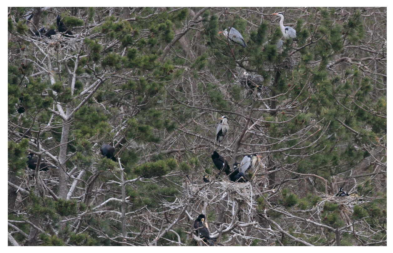
Mixed-species colony of Great Cormorants and Grey Herons at the study site in Aomori, Japan (19 April 2016).

'staying on nest' (a bird perched on its own nest or on a branch near the nest) or 'approaching the predator' (a bird left its own nest and perched on a branch near the predator). In addition, we considered alarm call and intimidation as aggressive behaviours. For the analysis, we used all birds that were within a 5-m radius of the predator when the predator appeared.