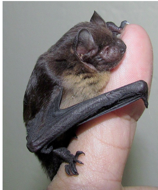
Fig. 1. Picture of the live adult male H. joffrei ZSI V/M/ERS/292. Note the dark brown, glossy appearance of the dorsal pelage, and the sharp demarcation between the dorsal and lighter ventral colour.

The preserved animal has long and narrow wings, much like those of Nyctalus spp., with the fifth digit being noticeably reduced (46 mm in total length) when