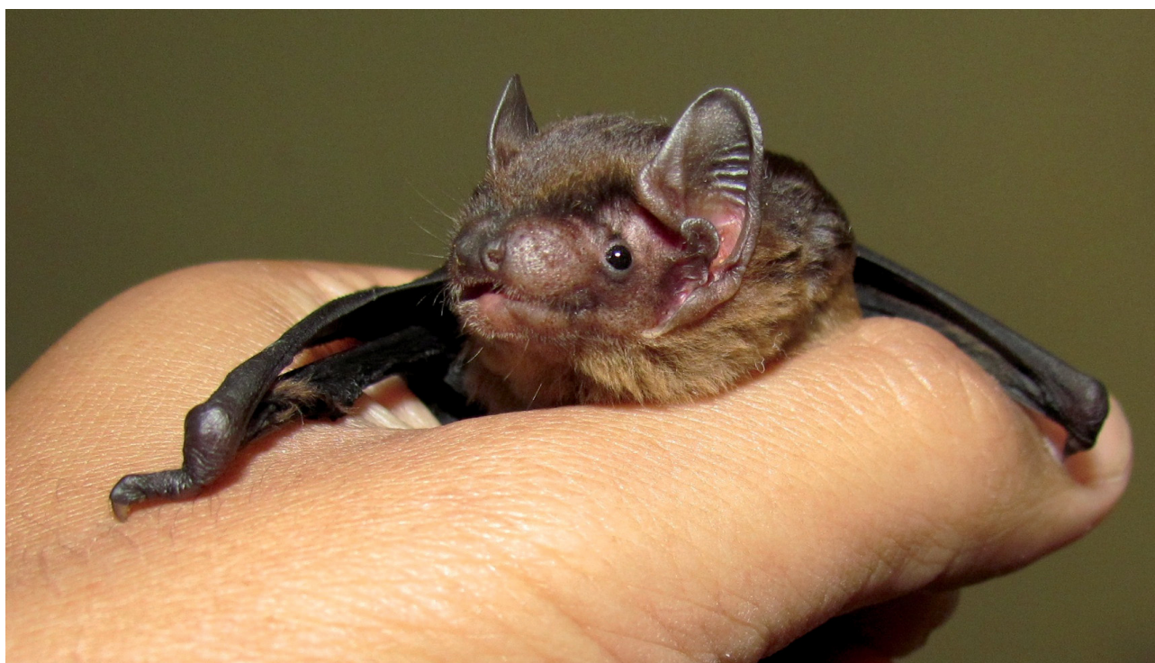
Fig. 2. Portrait of H. joffrei specimen ZSI V/M/ERS/292. Note the enlarged muzzle and short, roundish tragus.

lower canines are long and slender, and lack secondary cusps. The first lower premolar ( P_2 ) is slightly less in height than the second premolar ( P_4 ); both premolars are compressed in the toothrow. Contrary to all true Pipistrellus species, the lower molars in our specimen are myotodont which corresponds to the dental configuration found in Hypsugo (Horáček & Hanák, 1985-86).