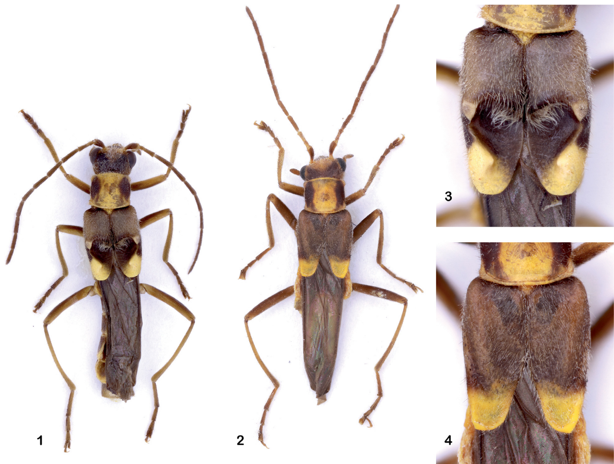
Figs 1-4. Paramaronius unituberculatus sp. nov. (1) Dorsal habitus of male (holotype, NMB). (2) Dorsal habitus of female (paratype, MZSP). (3) Detail of the elytra of male. (4) Detail of the elytra of female.

and legs light brown, darker on the dorsal surface of femora and pro- and mesothoracic tarsi. Abdomen dark brown, yellow on the margins of each ventrite and tergite; last ventrite completely brown.